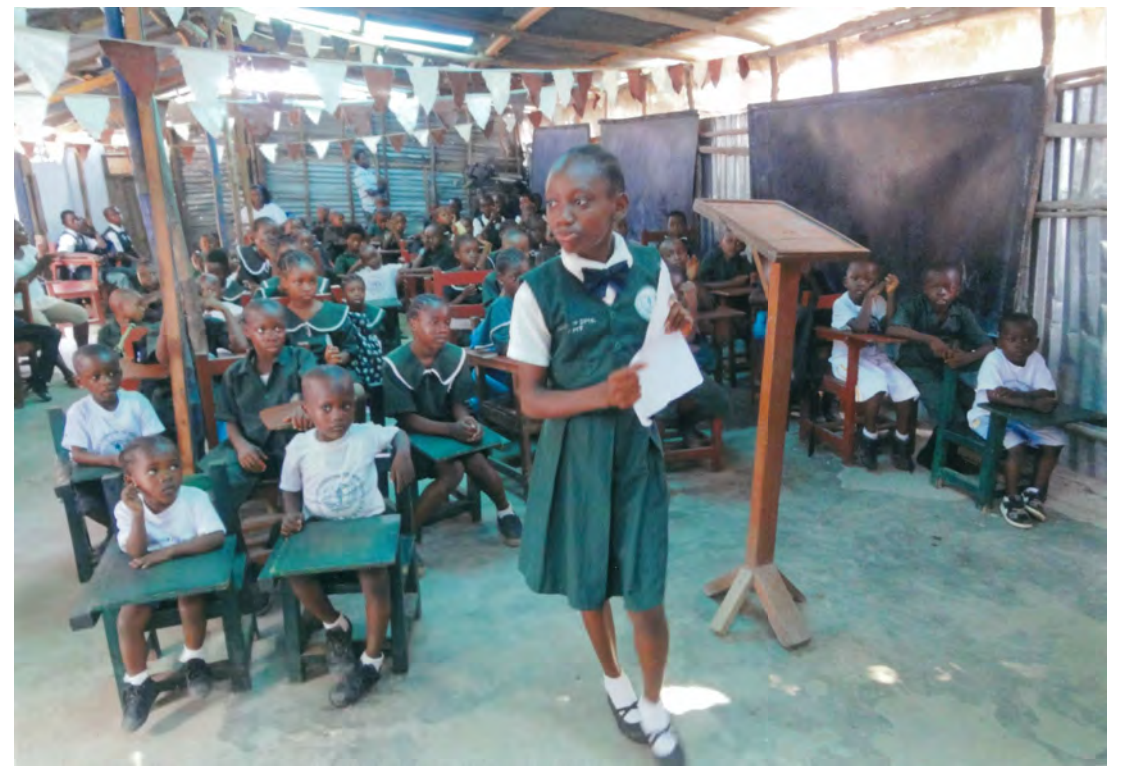
Click here to read more about the schools and WFWP USA support.