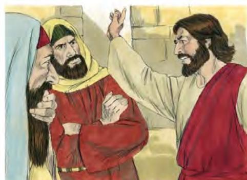
Jesus preaching. Illustration: Biblical illustration of Gospel of Mark Chapter 3 by Distant Shores

There are six famous sayings of Jesus that all share the same pattern: They take