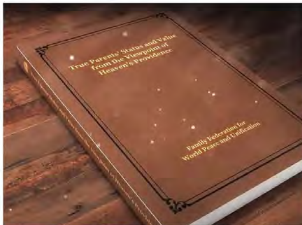
A pre-publication version of "True Parents' Status and Value from the Viewpoint of Heaven's Providence".

Why I mention this is because I believe the reception of the new material –