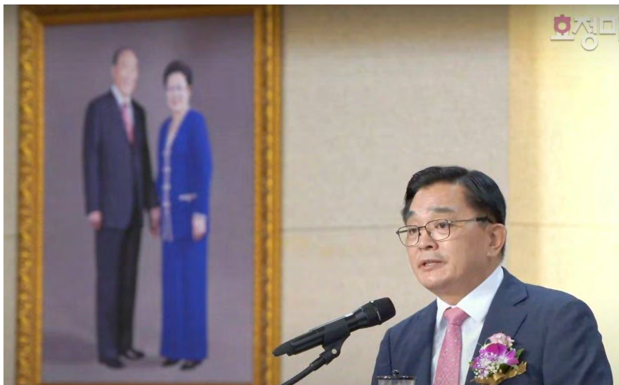
From the inauguration of Bo-guk Hwang on 1st August 2024