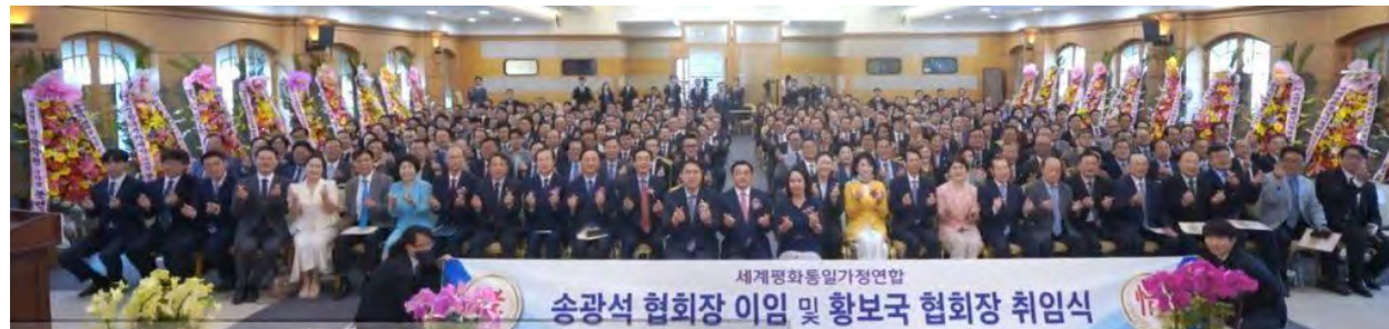
From the inauguration ceremony 1st August 2024

Sunhak UP Graduate School. He began his ministry at the Gangwon Diocese of the Family Federation in 1991 and has since then held various leadership positions within the Family Federation in the provinces of Gyeonggi and Gangwon.