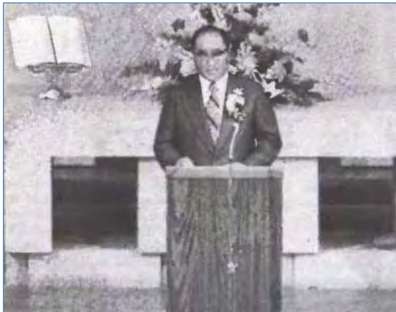
Rev. Moon delivered his Commencement Address, "Become a Physician and Leader," in English

July 1 was, as Rev. Moon remarked in his Seminary graduation address, a very significant day in the history of the Unification Church. In a ceremony marked by dignity, the first class of the Unification Theological Seminary graduated from their two-year Master of Religious Education program.