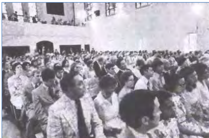
Parents, fellow students and friends came to honor graduating Seniors