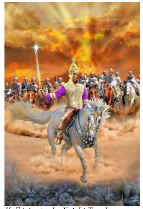
Kalki Avatar by Yuichi Tanabe

... Come ye people all around the world, lets unite into one."