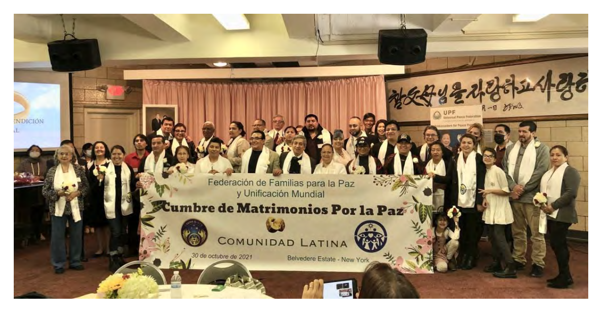
Latino Marriage Blessing Seminar