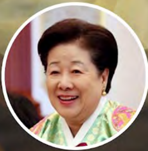
KEYNOTE ADDRESS: Dr. Hak Ja Han Moon The Mother of Peace