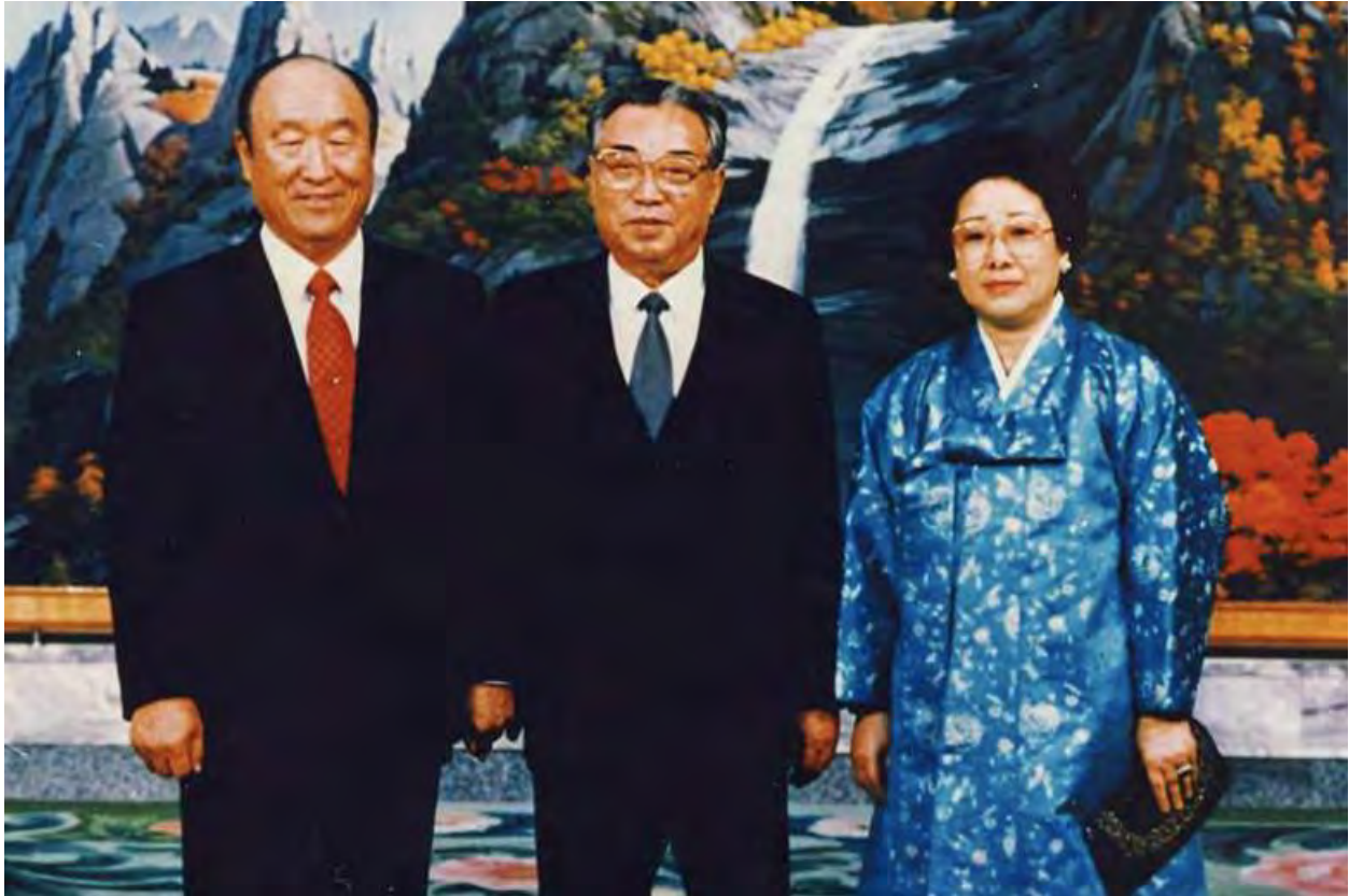
Rev. and Dr. Moon met President Kim Il Sung in Pyongyang in 1991

"Seeking the shortest path to a world of peace, I devoted myself to inspiring change in the political process and to changing people's ways of thinking," wrote True Father in his autobiography, As a Peace-Loving Global Citizen (2009). "I met then-President Kim Il Sung of North Korea for a serious discussion on how to bring peace to the Korean Peninsula."