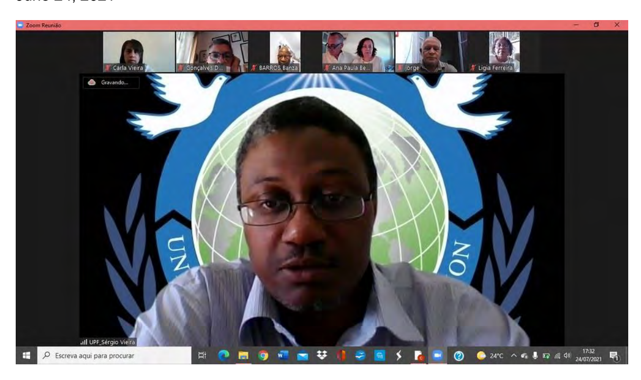
Lisbon, Portugal -- UPF Ambassadors for Peace were invited to a dialogue on "Interdependence and Living for the Sake of Others."

The online meeting on July 24, 2021, gathered both the most recent and the earliest Ambassadors for Peace to discuss the meaning of values advocated by Ambassadors for Peace around the world.