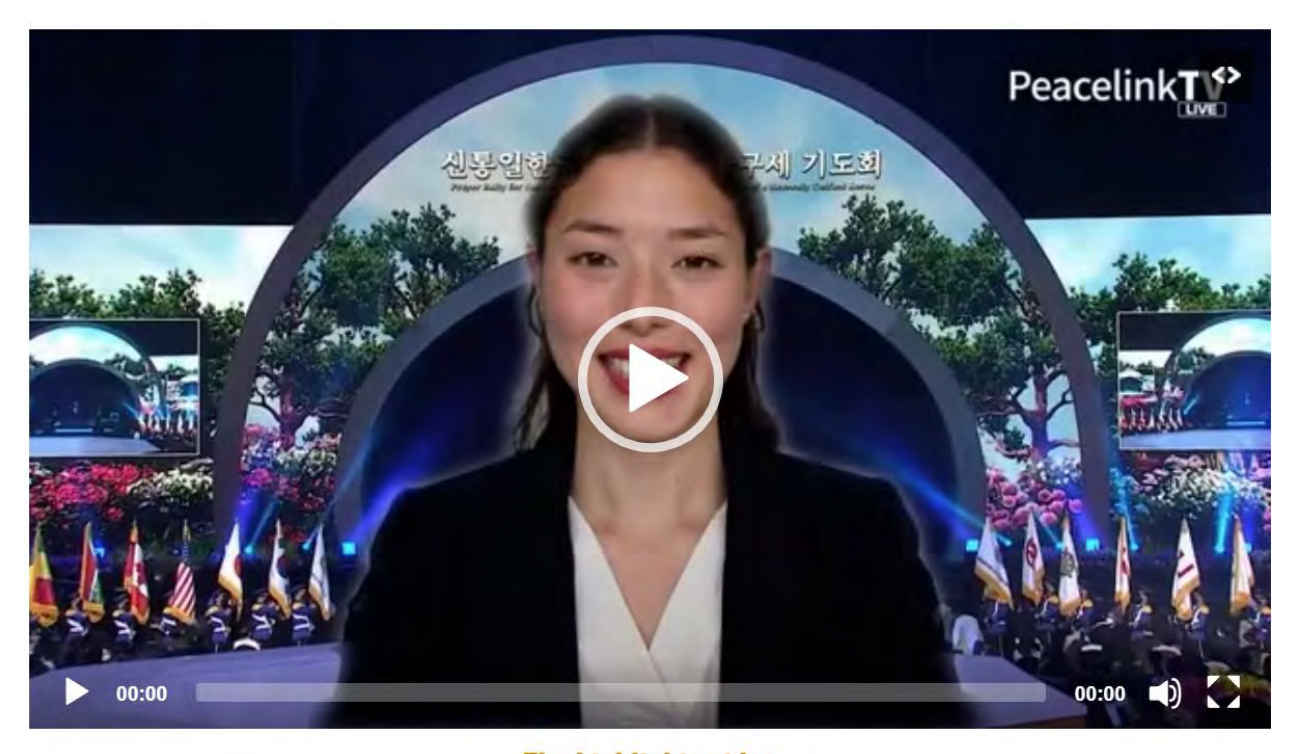
The highlights video