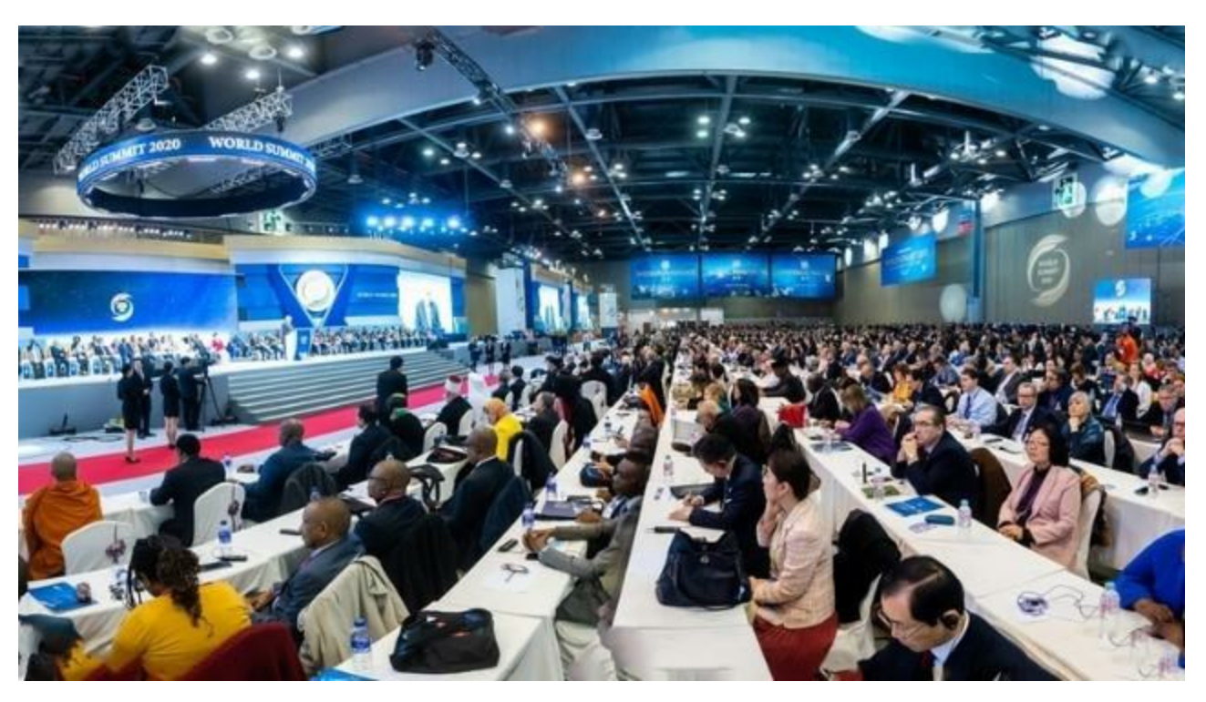
Opening Plenary of World Summit 2020, Kintex Center, Seoul, Korea, February 3-8, 2020.

The UPF is active through a number of specialized organizations, each of which holds its own events: