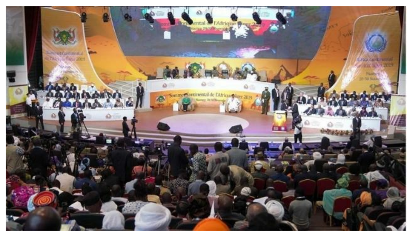
Opening of the Africa Continental Summit Niger 2019, on November 28, 2019, with President Mahamadou Issoufou.