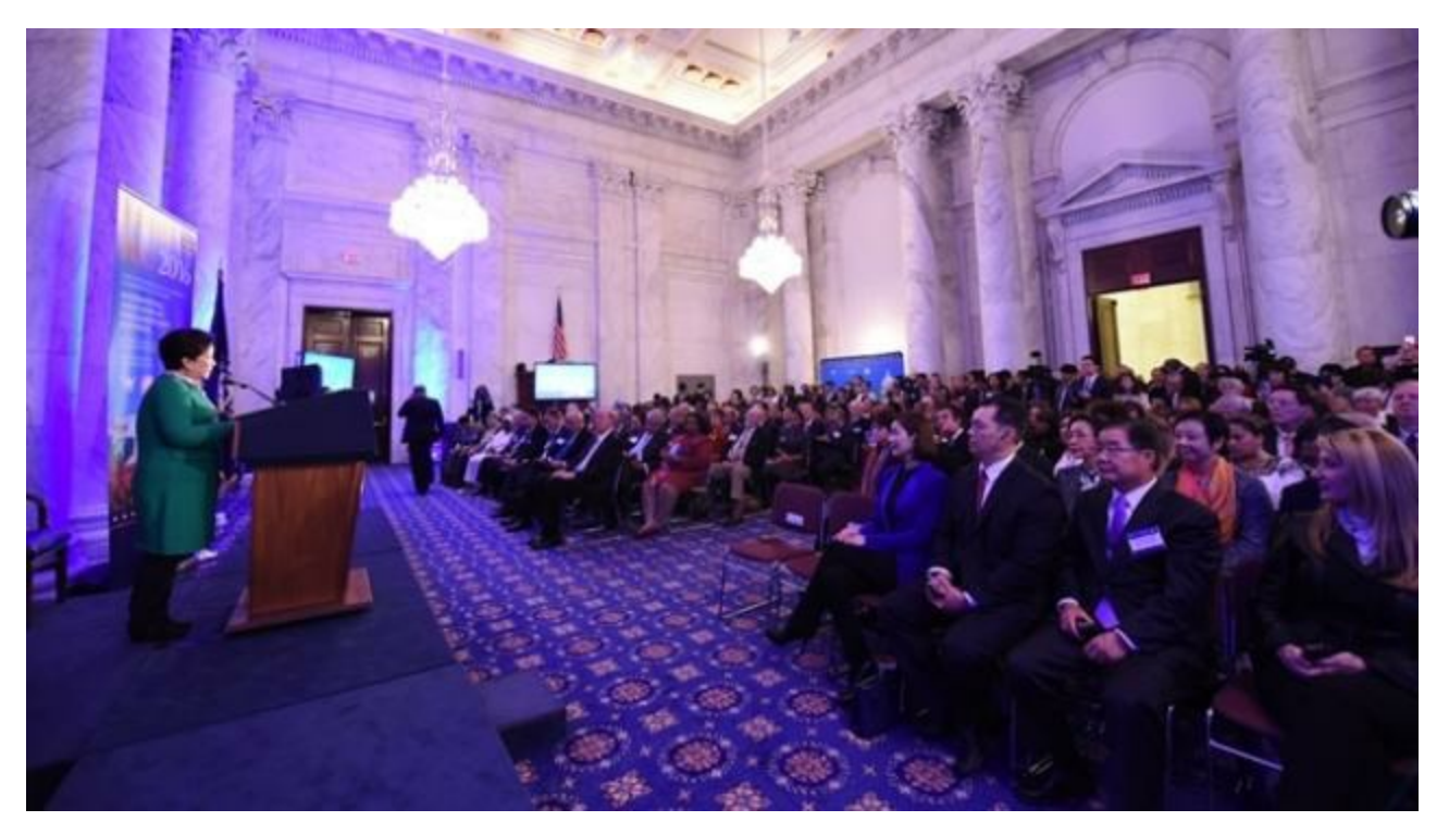
November 30, 2016, Washington, D.C., United States Senate (Kennedy Caucus Room) – Launch of the International Association of Parliamentarians for Peace (IAPP).

The International Association of Parliamentarians for Peace (IAPP) was launched on February 15, 2016, at the National Assembly of the Republic of Korea. It gathers parliamentarians from all around the world, and organizes forums promoting peace and democracy, and fighting corruption. National meetings of IAPP members have been organized in such diverse locations as Manila, London, Rome and Asunción, and the association has emerged as one of the largest and most active branches of the UPF. In the United States, the inaugural meeting was hosted by then pro tempore President of the Senate, Orrin Hatch.