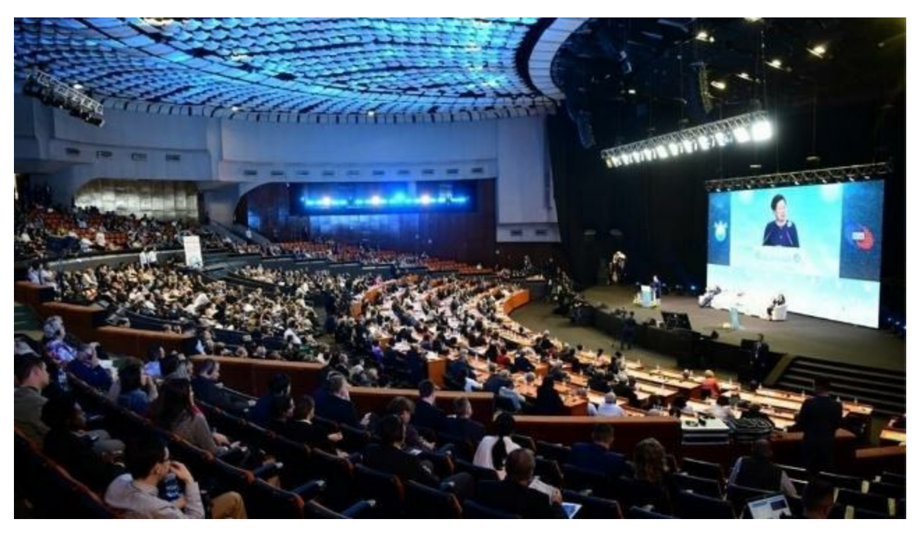
Opening of the South-East Europe Peace Summit, in the Tirana Assembly Hall, Albania, on October 26, 2019.

Large UPF conferences gathered former (and sometimes current) presidents and prime ministers of different countries, as well as religious and cultural leaders. These gatherings included the Continental Africa Peace Summit 2018, inaugurated in Dakar, Senegal on January 18, 2018; the South-East Europe Peace Summit, opened in Tirana, Albania, on October 26, 2019; the Asia Pacific Summit, which started in Phnom Penh, Cambodia, on November 19, 2019; the Africa Continental Summit Niger 2019, whose opening ceremony was held in Niamey, Niger, on November 28, 2019; the World Summit 2019 in Seoul, South Korea, on February 7–9, 2019; the World Summit 2020, which also took place in Seoul on February 3–8, 2020. Regional meetings were also organized, including the recent Balkans Leadership Conference, organized in Tirana, Albania, on November 20–21, 2021, which led to the signature of a Memorandum of Cooperation between the UPF and the Podgorica Club, an organization established in 2019 by former presidents of Southeast European countries.