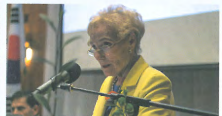
Presentation by Erna Hennicot-Schoepges, former President of the Parliament of Luxembourg