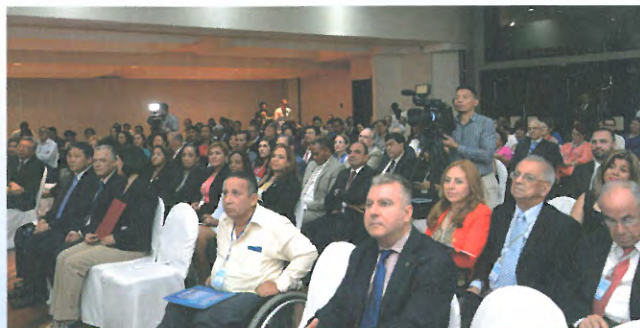
Launch of the IAPP in Central America