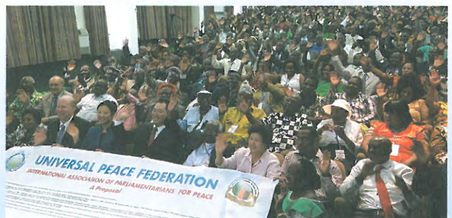
Commemorative Photo at Launch of IAPP in East Africa