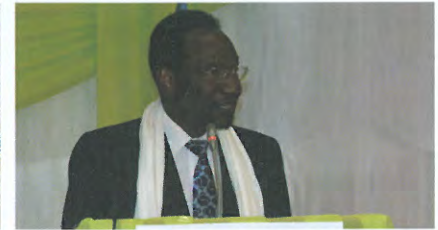
Dioncounda Traore, former President of Mali