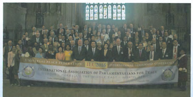
Commemorative photo of participants following Inauguration Ceremony