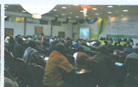
Launch of IAPP in West and Central Africa - Ouagadougou, Burkina Faso