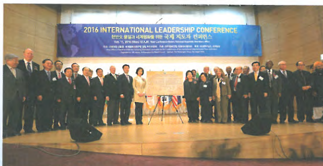
Commemorative photo after signing at the inauguration of IAPP