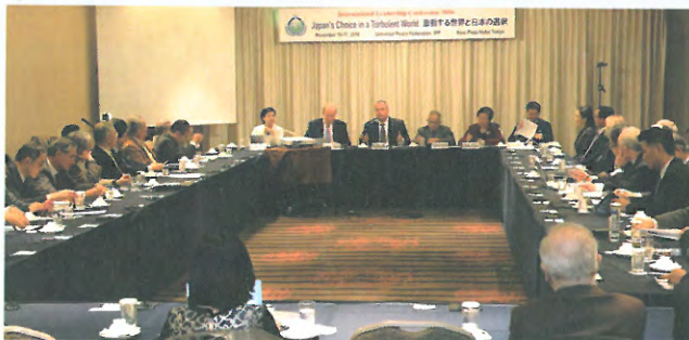
Launch of IAPP in Japan