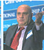
Issawi Frej, Parliamentarian from Israel