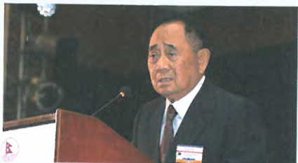
Speech by Jose de Venecia, Jr., former Speaker of the House of the Philippines