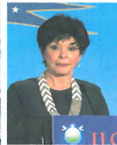
Barbara Cubin (R-Wyoming), former U.S. Congresswoman