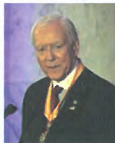
Orrin Hatch (R-Utah), President pro tempore of the United States Senate