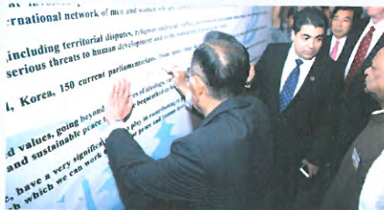
Signing at the Launch of IAPP in the Asia-Pacific