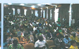
Launch of IAPP in East Africa - Lusaka, Zambia