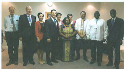
Commemorative Photo of Participants