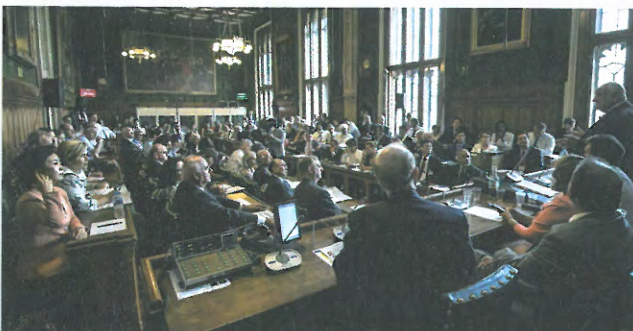
Inauguration Ceremony (UK Congress)