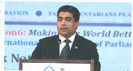
Keynote Address by Ek Nath Dhakal, Minister of Nepal