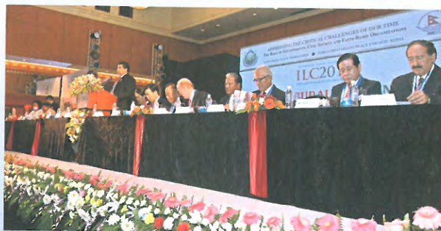
Discussion with Topic of "Peace-Building, Human Rights, and Climate Change"