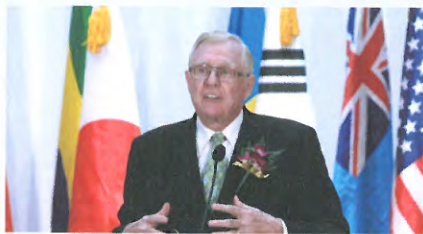
Speech by Rep. Dan Burton (R-Indiana), Chairman of Promotion Committee (former U.S. congressman)

The resolution to form the International Association of Parliamentarians for Peace stated, "North Korea continues to develop its nuclear weapons program, raising serious concerns all over the world that military tensions are rising throughout Northeast Asia" and resolved, "Let us show the example and pursue the path of mutual cooperation and mutual prosperity, building a world of lasting and sustainable peace that can be bequeathed to future generations."