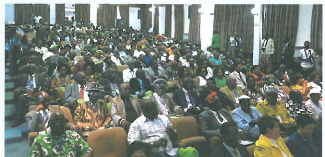
Launch of IAPP in East Africa (National Assembly of Zambia)