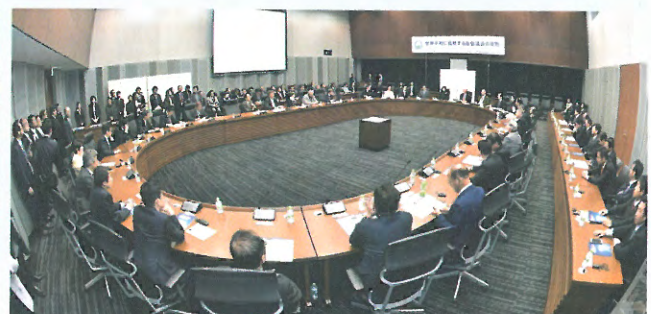
Launch of IAPP in Japan (Japanese National Assembly)