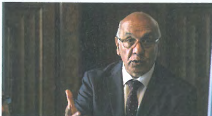
Virendra Sharma, Member of the British Parliament