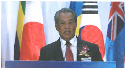
Tan Sri Muhyiddin, Vice Prime Minister of Malaysia