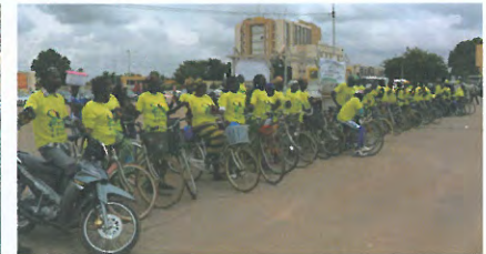
Opening of the Peace Road in Burkina Faso