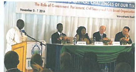
Presentation by Geoffrey Lungwangwa, Parliamentarian from Zambia