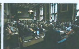
Launch of IAPP in Europe, Middle East, and North Africa - London, United Kingdom