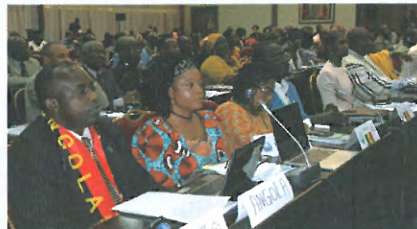
Launch of IAPP in West/Central Africa