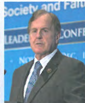
Robert Pittenger (R-North Carolina), U.S. Congressman