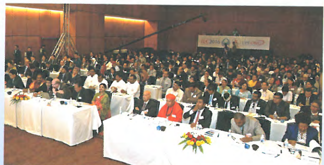
Launch of International Association of Parliamentarians for Peace in the Asia-Pacific