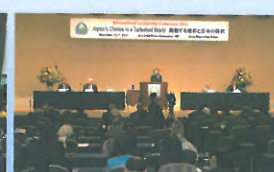
Launch of IAPP in Japan - Tokyo, Japan