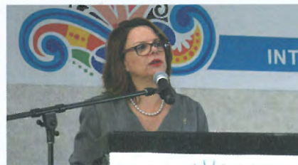
Ana Helena Chacon, Vice President of Costa Rica