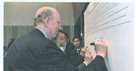
Signing of Resolution at the Launch of IAPP in Japan