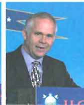
Tim Huelskamp (R-Kansas), U.S. Congressman