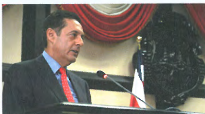
Antonio Alvarez Desanti, President of Costa Rican Parliament

In particular, Forum of Presidents of the Legislative Bodies of Central America and the Caribbean Basin (FOPREL), including Central America, Mexico and the Caribbean, signed a Memorandum of Understanding (MOU) with Universal Peace Federation (UPF), the sponsor of this event, as an agreement to work together for the realization of a peaceful world.