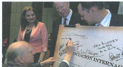
Signing by Former President of Uruguay, Julio Maria Sanguinetti Coirolo