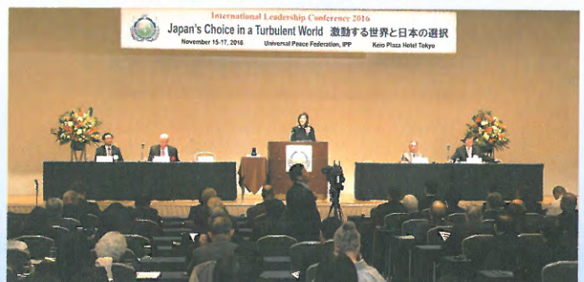
Launch of IAPP in Japan