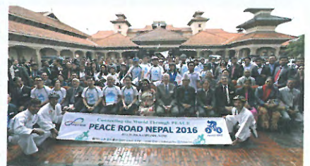
Opening of Peace Road in Nepal