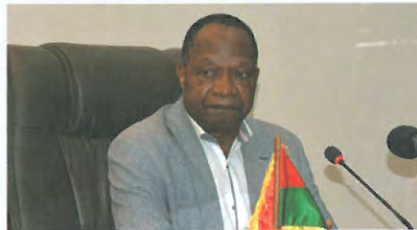
Charles Lona, Chair of the Launch of the IAPP in West/South Africa and Deputy Speaker of the House of Burkina Faso

The ILC was held under the theme, "Addressing the Critical Challenges of our Time: The Role of Governments, Parliaments and Civil Society," and was attended by 400 participants, including Dioncounda Traore, former President of Mali; Lona Charles Ouattara, Deputy Speaker of the National Assembly of Burkina Faso; Awudu Mbaya, Cyprian, Deputy Speaker of the National Assembly of Cameroon; Gilbert Bangana, Deputy Speaker of the National Assembly of Benin; 4 current and 7 former ministers; 160 parliamentarians from 24 nations; 5 army commanders; 12 chiefs; 40 representatives of the African media; diplomats; professors; Christian and Muslim leaders, etc.