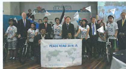
Launch of Peace Road in Costa Rica