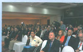
Launch of IAPP in Central America - San José, Costa Rica