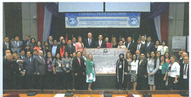
Commemorative photo after signing at the launching of the IAPP in South America