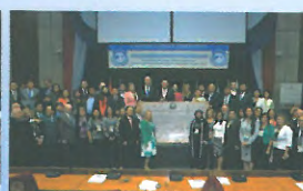
Launch of IAPP in South America - Asunción, Paraguay