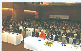
Launch of IAPP in the Asia-Pacific - Kathmandu, Nepal