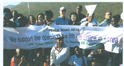
Opening of Peace Road in Zambia