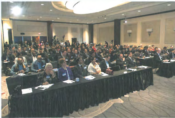
Launch of the International Association of Parliamentarians for Peace in North America

As our world faces a wide range of problems that pose a serious threat to human development and to the realization of world peace, including territorial disputes, religious and racial conflicts, environmental degradation, climate change, violent extremism, poverty, famine, nuclear proliferation and corruption, a group of parliamentarians from around the world gathered at the International Leadership Conference and formed an international network of men and women committed to solving the critical challenges of our time, and realizing a world of lasting peace.