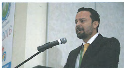
Jhon Fonseca, Deputy Minister for Foreign Trade of Costa Rica