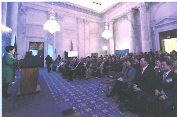
Launch of the International Association of Parliamentarians for Peace in North America (Kennedy Caucus Room of the Russell Senate Office Building)