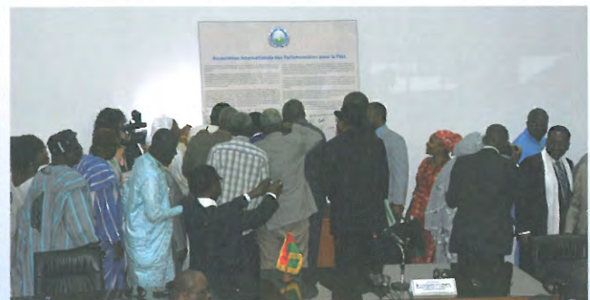
Signing of Resolution at the Launch of IAPP in West/Central Africa