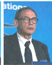
Nachman Shai, Parliamentarian from Israel