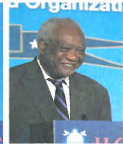
Danny K. Davis (D-Illinois), U.S. Congressman