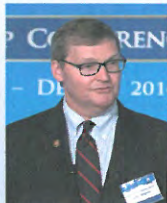
John Doolittle (R-California), former U.S. Congressman