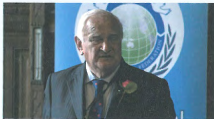
Lord Robin Eames, Member of the British House of Lords

In addition to former Albanian President Alfred Moisiu, the former President of Kosovo, Fatmir Sejdiu and former Austrian Minister of Defense Dr. Werner Fasslabend, as well as seven parliamentarians from the UK, 150 parliamentarians, diplomats, professors and religious leaders from 40 nations, including Germany, France, Italy, Israel, Jordan and Egypt, etc., attended the ILC. Under the theme, “Interregional Dialogue Addressing Critical Challenges: Europe, Eurasia, the Middle East and North Africa,” parliamentarians from Europe and the Middle East discussed how to resolve global conflicts, such as religious conflicts, environmental decline and terrorism, etc.