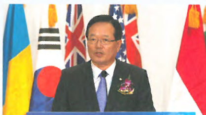
Congratulatory Message by Ui-Hwa Jeong, the Speaker of the National Assembly of the Republic of Korea (at the time)