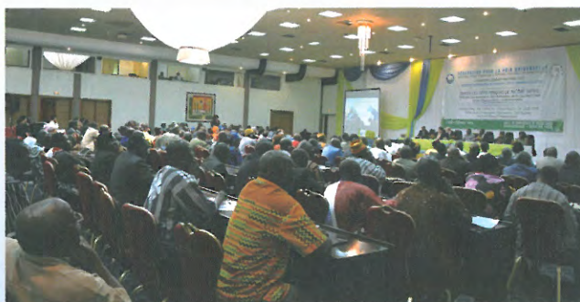
Launch of IAPP in West/Central Africa