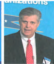
Todd Tiaht (R-Kansas), former U.S. Congressman