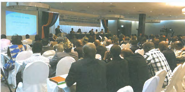
Launch of IAPP in East Africa