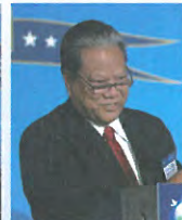
Kessai Note, former President of the Marshall Islands