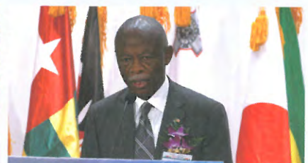
Edward Dagooseh, Senator of Liberia