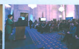
Launch of IAPP in North America - Washington, D.C., USA