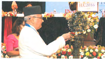
Opening Ceremony by Khadga Prasad Sharma, Prime Minister of Nepal