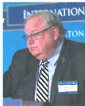
Woody Burton (R-Indiana), U.S. Congressman