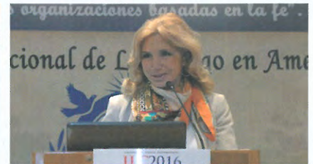
Graciela Rompani Delmond, former First Lady of Uruguay