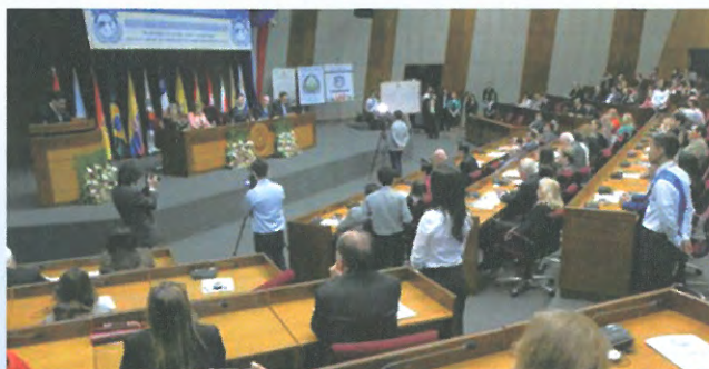
Launching of the IAPP in South America