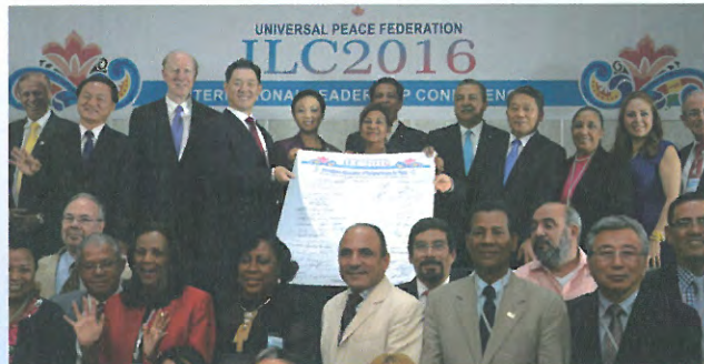
Commemorative photo after signing at the launch of the IAPP in Central America