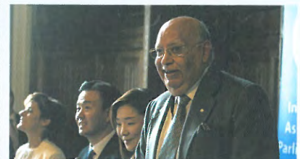
Lord Rajinder Loomba, Member of the British House of Lords