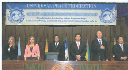
Before the Opening Ceremony