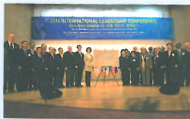
General Assembly of the International Association of Parliamentarians for Peace - Seoul, Republic of Korea

The International Association of the Parliamentarians for Peace (IAPP) is bringing together parliamentarians from around the world, forming an international network of men and women who are committed to solving the critical challenges of our time based on coexistence, mutual prosperity and realizing a world of everlasting peace.