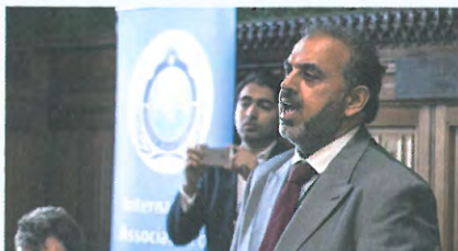
Lord Nazir Ahmed, Member of the British House of Lords