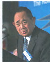
Hon. Jose de Venecia, former Speaker of the House of Representatives of the Philippines