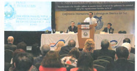
Discussion of Realizing World Peace through the Peace Road