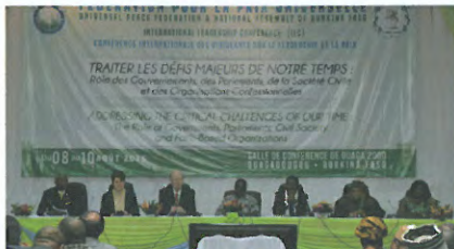
Launch of IAPP in West/Central Africa