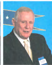
Dan Burton (R-Indiana), former U.S. Congressman