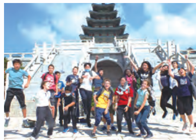
國立民俗博物館 National Folk Museum of Korea