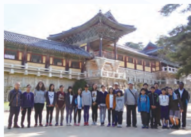
慶州-佛國寺 Gyeongju-Bulguksa Temple