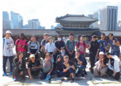
景福宮 Gyeongbokgung Palace