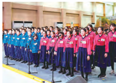
合唱發表 Congratulatory Song