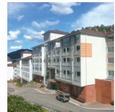
鮮鶴韓国語学院／鮮鶴留学生寄宿舎 Sunhak Institute & Dormitory

予備課程と中高等学校に進学中の祝福子女留学生たちは毎年、真の御父母様がくださる孝情奨学金を受けています。