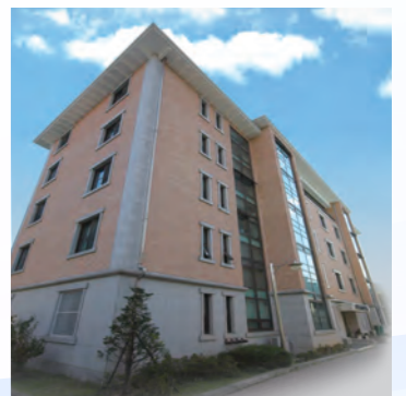
善正中・高校留学生寄宿舎 Sunjung Dormitory