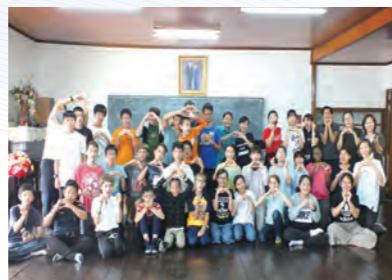
(旧)本部教会巡礼 The Old HQ Church