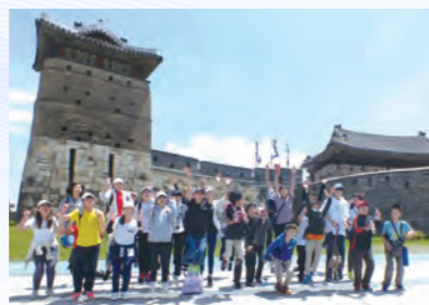
水原華城 Suwon Hwaseong Fortress