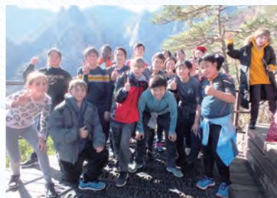
雪岳山 Mt. Sorak