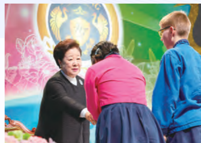
孝情奨学証書授与式 HyoJeong Scholarship