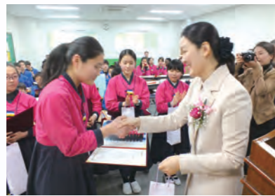
修了式 Graduation Ceremony