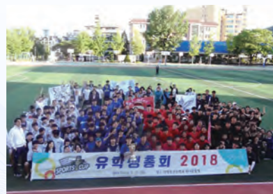
留学生体育大会 Sports Festival