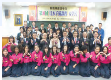
日本予備生入学式 Japanese students-Entrance