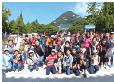
青瓦臺(大統領官邸) Blue House(Presidential Residence)