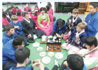
伝統茶道体験 Traditional Tea Ceremony