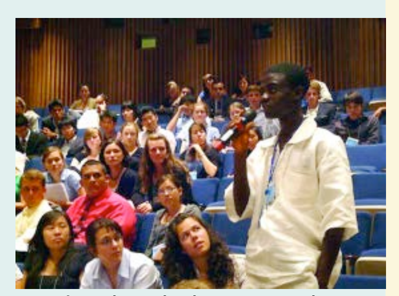
A question to the panel at the YFWP-sponsored Youth Forum at the United Nations in New York.

YFWP also organized two important youth forums at the United Nations Headquarters in New York. These forums addressed strategic responses to the problems of underdevelopment and the importance of an ethic of service and interreligious cooperation to create a culture of peace.