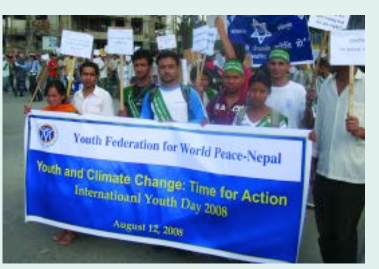
Young leaders call for action at a YFWP rally on climate change in Nepal's capital of Kathmandu.

Underscoring the growing effectiveness of YFWP's strategic partnerships, fifteen youth organizations joined in rally, which was followed by a Young Ambassador for Peace Award Ceremony and Education Program.