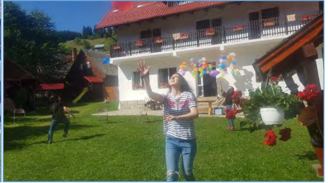
HwaDongHae : Day of Unity and Harmony!