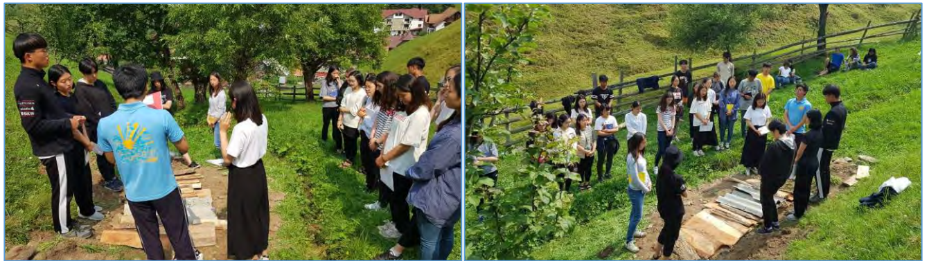
Action Task : Experience of SungHwa Ceremony