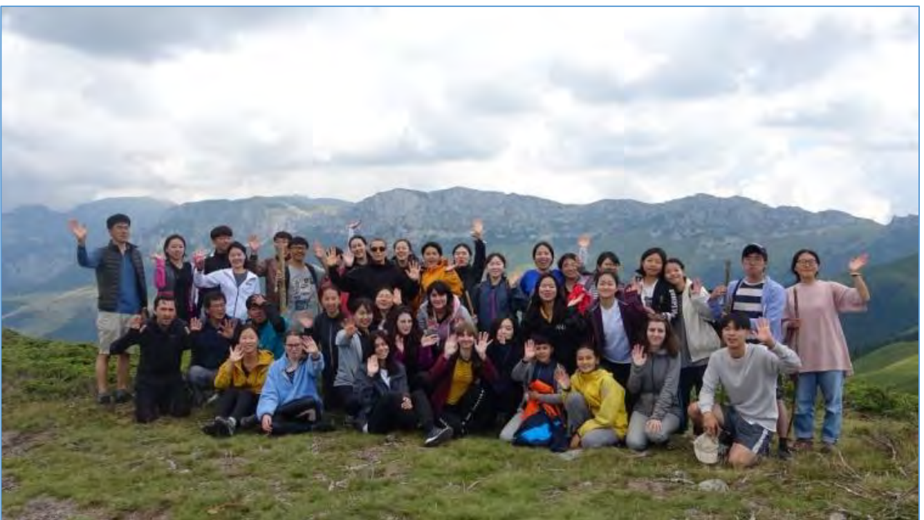
Mountain climbing day