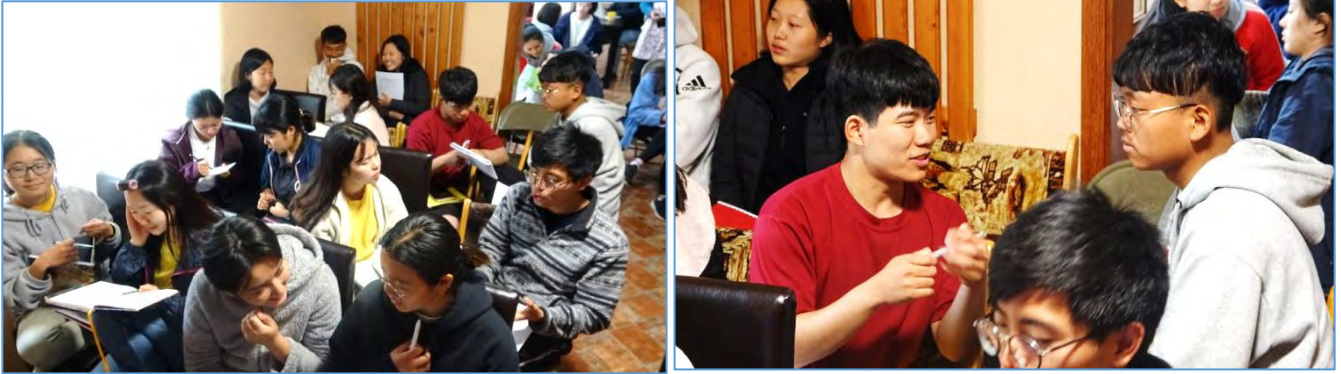
Divine Principle Lectures. After the each Divine Principle lecture we made pair in order to teach each other.