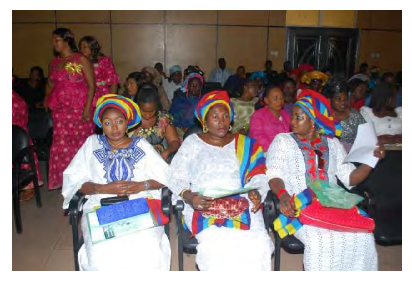
Ambassadors for Peace and their spouses were among the audience, as were women leaders of religious, political and nongovernmental organizations. Delegations from the National Council of Women's

Participants from government as well as from nongovernmental, faith-based and community organizations attended "Beyond the Challenges of Our Time: The Role of Women in Transforming the Family, Society and Nation." The assembly was held on March 10, 2015, at the National Merit Award House in the Maitama district of Abuja, the nation's capital.