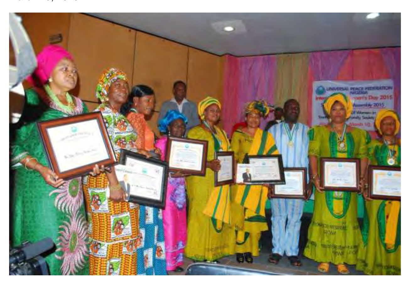
Abuja, Nigeria — Approximately 100 distinguished guests attended a Special Women's Assembly held by UPF-Nigeria to mark International Women's Day.

Participants from government as well as from nongovernmental, faith-based and community organizations attended "Beyond the Challenges of Our Time: The Role of Women in Transforming the Family, Society and Nation." The assembly was held on March 10, 2015, at the National Merit Award House in the Maitama district of Abuja, the nation's capital.