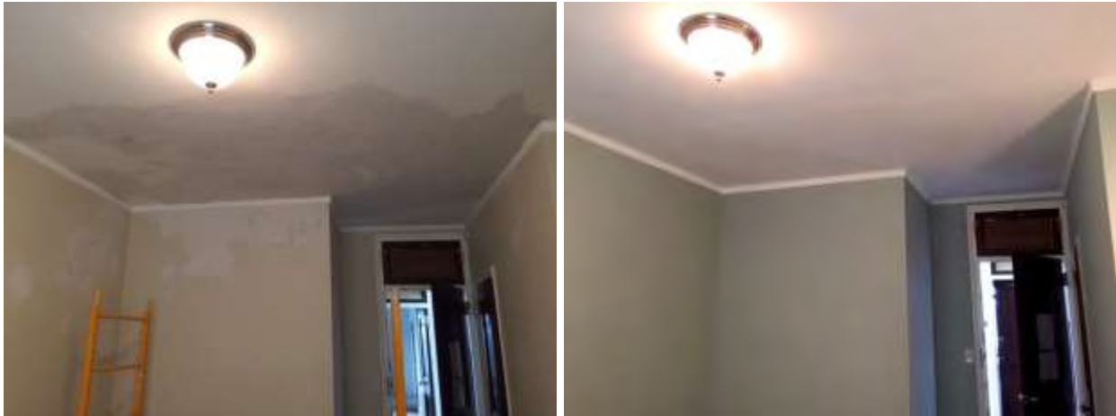
Before left, after right

All-in-all, since renovations began in 2012, several projects have been completed, including (but not limited to): removing peeling paint, patching, and repainting the walls, ceilings and floors of the library, East Wing dorms, West Wing hotel rooms, bathrooms, stairs, the chapel, dojang, and the professors' offices and classrooms, including Lecture Hall II. Shannon also has done extensive work on the exterior doors, stripping them down and re-finishing them.