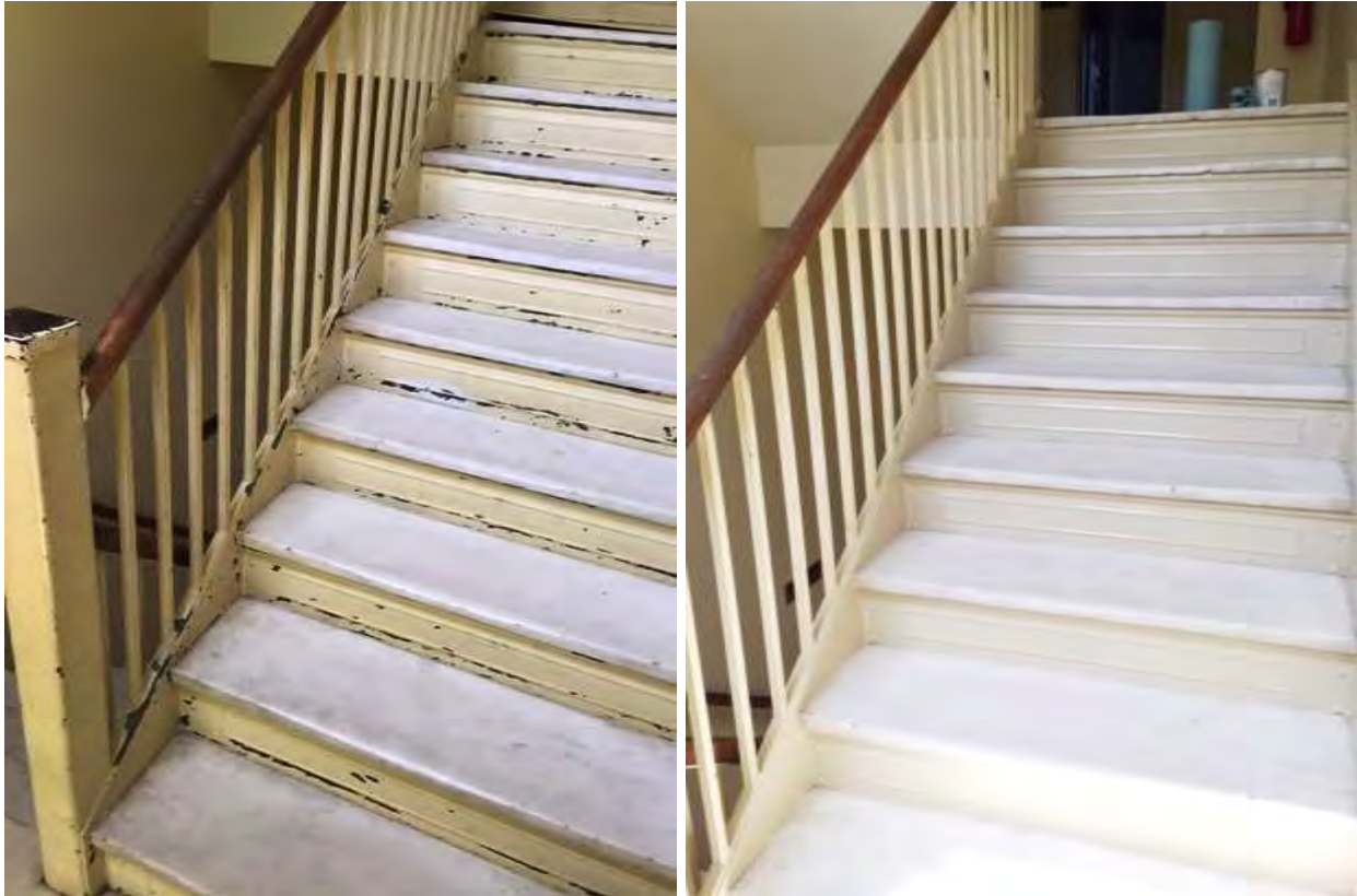
Before left, after right