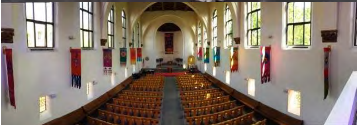
Before above, after below