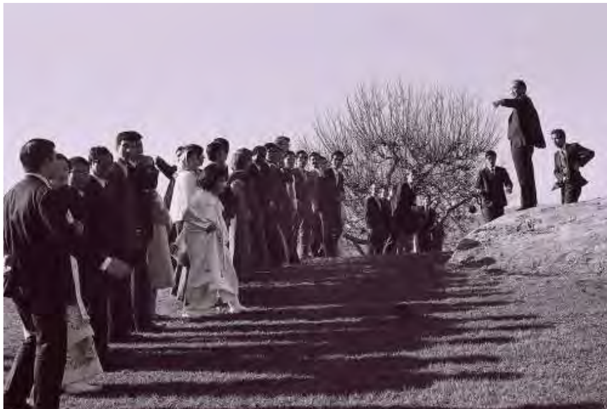
Reverend Sun Myung Moon speaking at holy rock at Belvedere, Tarrytown, NY, in 1973

Since we have free will, we need to step out and try stuff; we need to make new relationships, we have to try new things, we have to win people's hearts, not because "mom said so," but because it's the right thing to do.