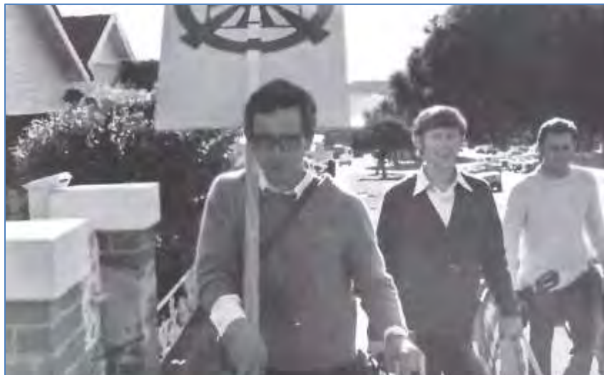
Sydney Unification Church heads for witnessing at the beach

This month's activities have featured the compiling of 1,500 copies of the "Principle of Creation," with Reverend Moon's picture stenciled onto each copy. We are looking forward to distributing these in our witnessing.