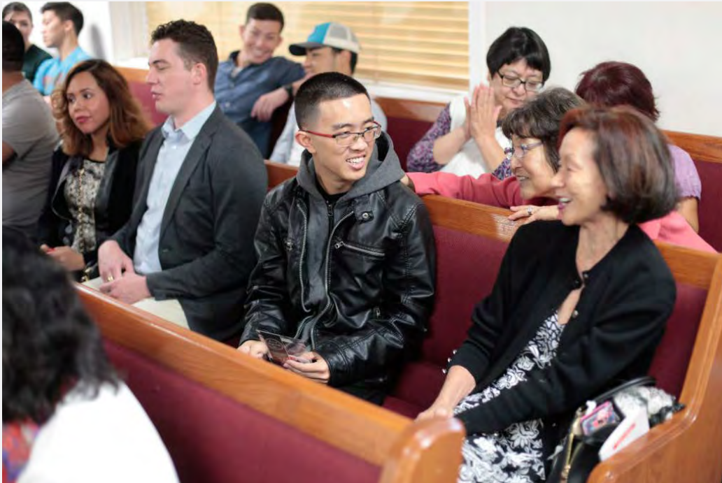
The audience made new friends and deepened relationships in their pair share.