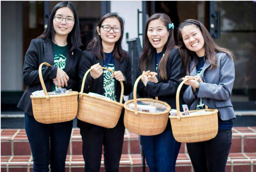
Ushers greeted attendees at the entrance with little gifts for each of them!

The entire program lasted until 6pm. While the staff, cooks, ushers, and backstage members felt exhausted from preparing and hosting for two days, we all felt a sense of fulfillment that we were able to connect with so many people on a deeper level.