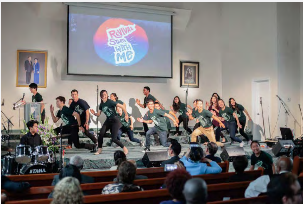
CARP LA perform their show-stopper, Mujogeon, to close the rally.