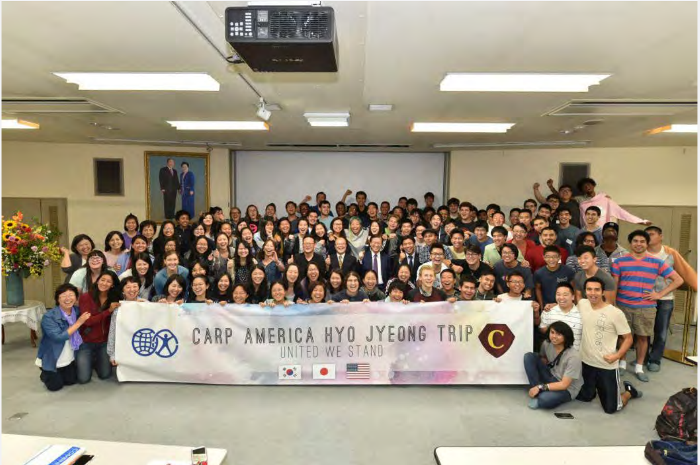
Welcome to the 3rd Annual HyoJeong Trip!