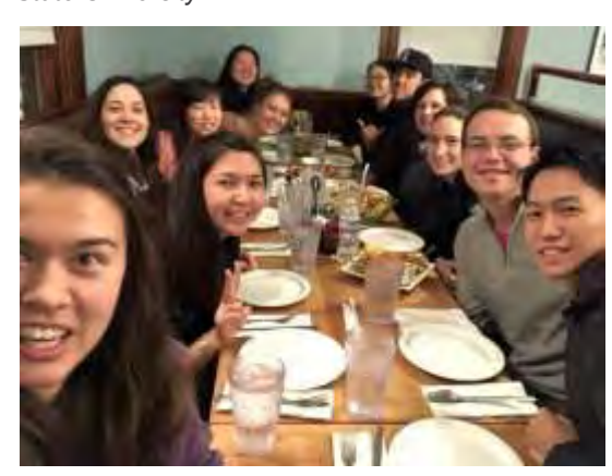
Connecting with the CARP chapter from Chicago with deep dish pizza!