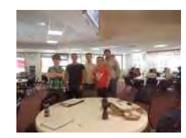
Weekly Club Meetings @ Local Chapters