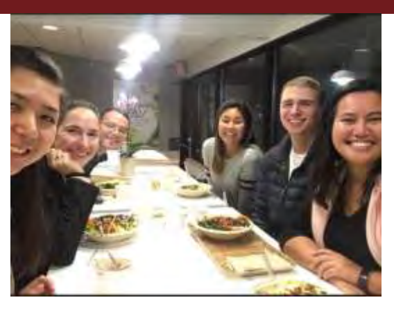
Connecting with students and alumni from Ohio State University!