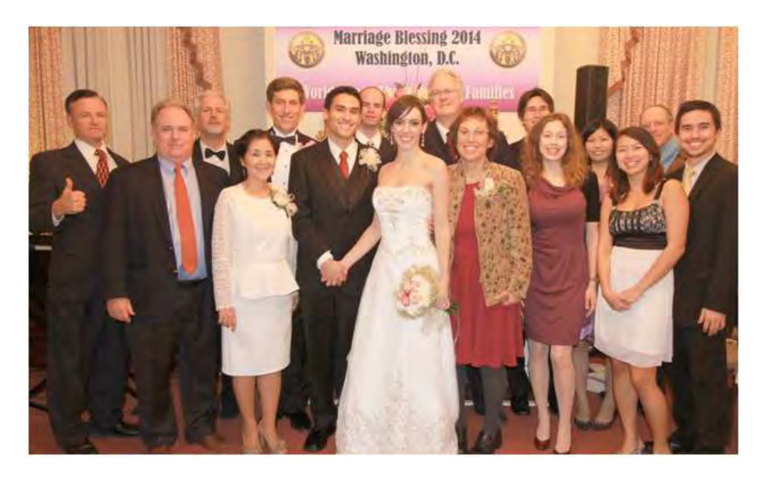
Local blessing planning team for the 2014 Maryland Blessing