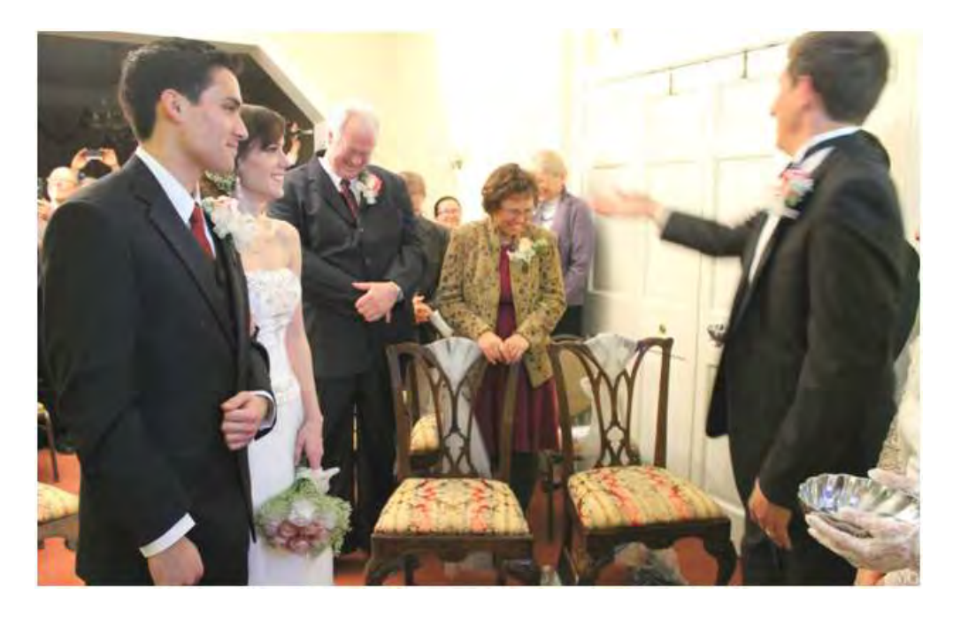
Holy water! Sprinkling the holy water of blessing

A mother shares her joy and pride in to see her son arrive at the day of his blessing marriage the same as she did some 30 years before. Each parent and the bride and groom shared a reflection creating a warm family relaxed atmosphere.