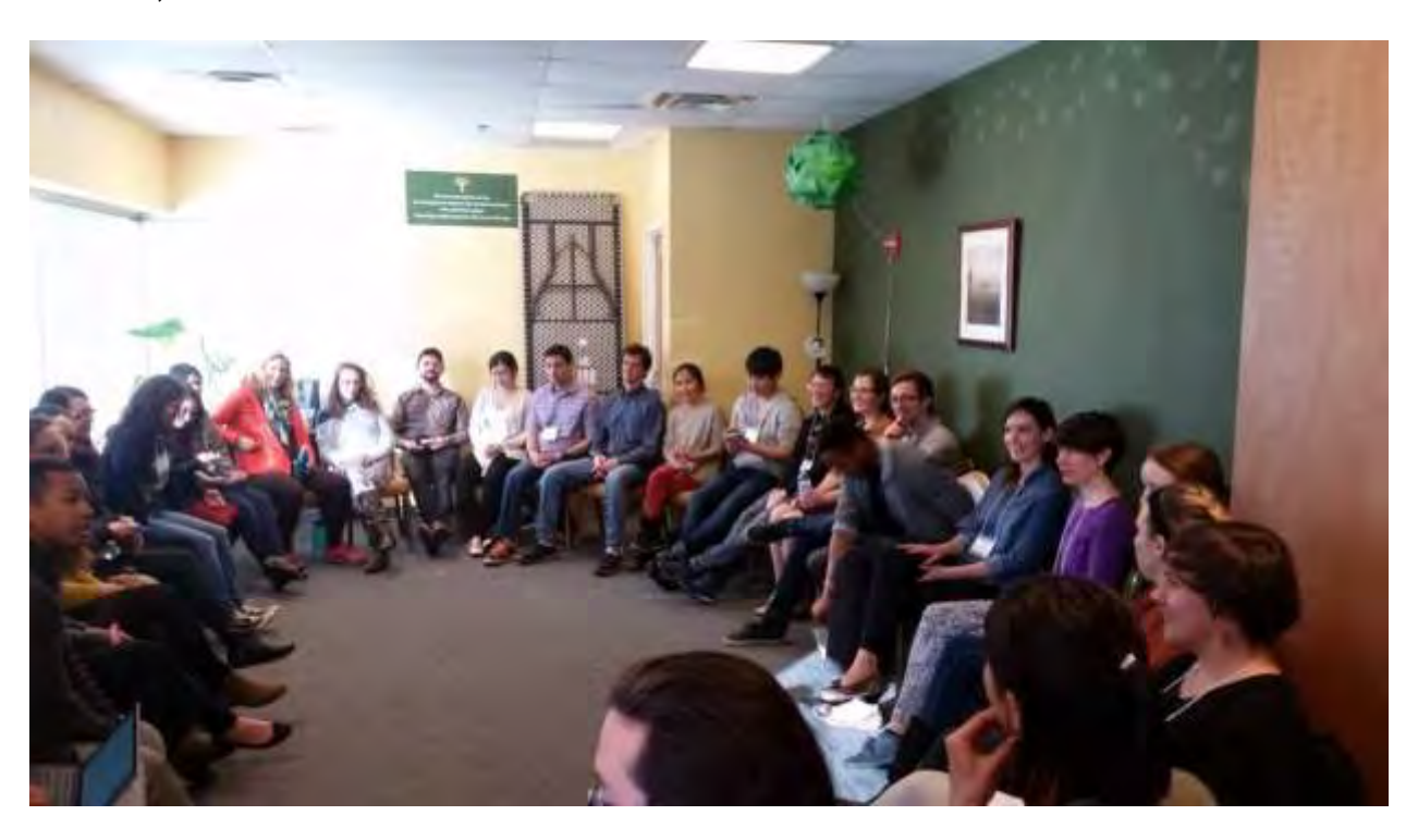
"Honoring the Generations" was the theme of a Project Phoenix weekend workshop held at the Maryland Family Center from March 3 to 5, 2017.

Project Phoenix was founded in 2016 with the goal of uniting the generations in the larger Unificationist community. At a strategic planning retreat last year, the Project Phoenix staff decided to hold regional events that would focus on Unification communities. The hope was that participants would receive inspiration, tools, and support to build bridges between elder and younger Unificationists, creating new possibilities for community growth.