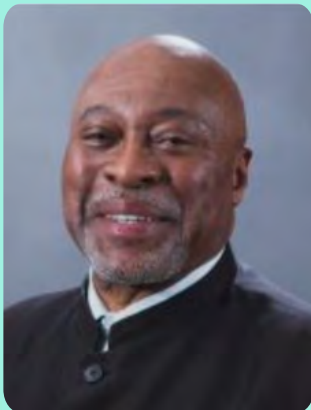
Moderator: Patriarch George A. Stallings, Jr Imani Temple African American Catholic Congregation, Chair, IAPD - USA