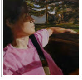
Yoko in Sun On Hold