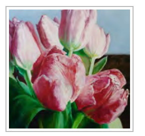
In the Tulips $200