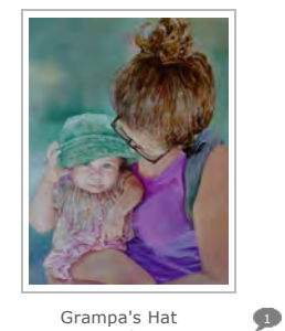
Grampa's Hat NFS