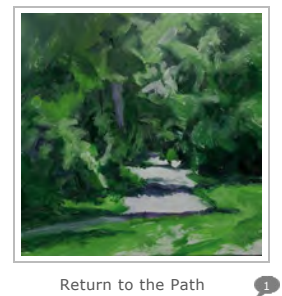
Return to the Path