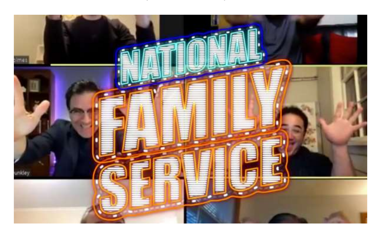
Sunday May 10 at 11 a.m. EST

Has social distancing got you more desperate for answers? Then tune in to our National Family Service from the comfort of your own home every Sunday at 11 a.m. EST. Pets welcome. Sunday best dress code optional.