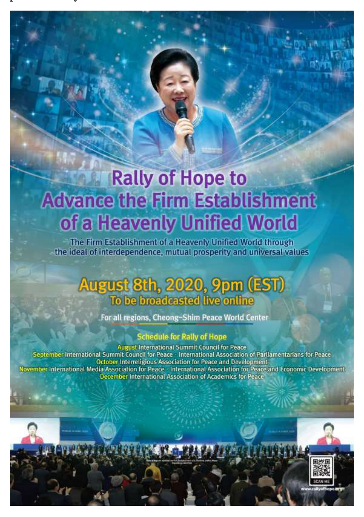
p.m. EST. Stay tuned for broadcast details.