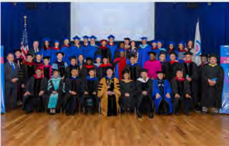
Congratulations to the Class of 2023!