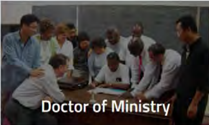
Doctor of Ministry