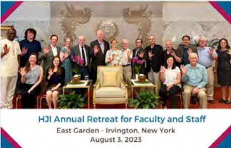
HJI Annual Retreat for Faculty and Staff East Garden - Irvington, New York August 3, 2023

HJI Annual Retreat for Faculty and Staff 08.03.23