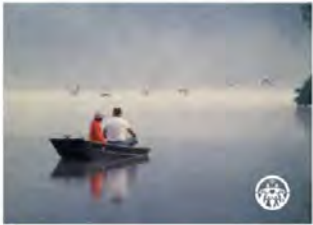
2023 DIGITAL CALENDAR $ 0.00