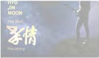
Album: HYO JIN MOON - The Best "HyoJeong" Compilation $ 43.00