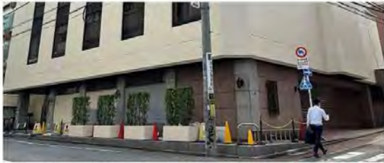
Tokyo headquarters of the Family Federation of Japan . Photo. Asanagi / Wikimedia Commons. Public domain image. Cropped

September 2023 announcement by the Ministry of Education, Culture, Sports, Science and Technology (MEXT) that the Family Federation of Japan would be fined for not answering properly to questions from the ministry, the Family Federation held a press conference the day after, 8 th September, at the national headquarters in Shibuya, Tokyo.