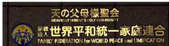
Sign at the entrance of the Family Federation's national HQ in Tokyo. Cropped

He explained why there are no reasons for dissolution,