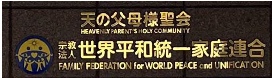
Sign at the entrance of the Family Federation 's national HQ in Tokyo

Personally, I am extremely surprised by the stance of public opinion in Japan against our members. Do they know that countless numbers of Japanese citizens moved to every continent of the globe to serve local villages, towns, cities, communities, and churches? These Japanese citizens are all married, raising healthy families, and instilling values that Japanese culture is known for, such as filial piety, respect for elders, and the mindset of public service for the sake of others. I have not met any other group from Japan that has had as much positive influence around the world. Regardless of people's current religious beliefs, I believe that the Japanese people should be proud of the dedicated, selfless work of the Family Federation .