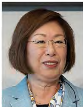
Keiko Nagaoka, government minister for education, culture, sports, science and technology (MEXT).

On 15th October, Nagaoka, Minister for MEXT, told a press conference, "Based on precedents, we are cautious. At the moment, it is difficult to order a dissolution request."