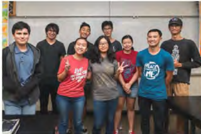
California Cypress College