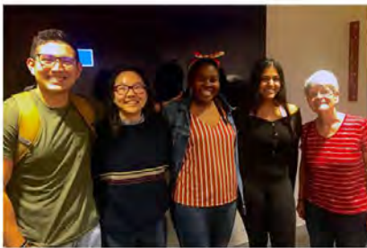
Arizona Arizona State University