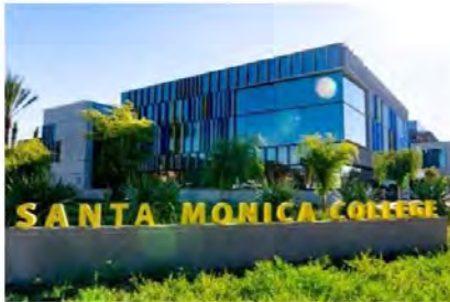
California Santa Monica College