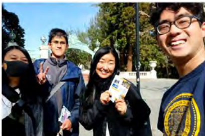
California University of California, Berkeley