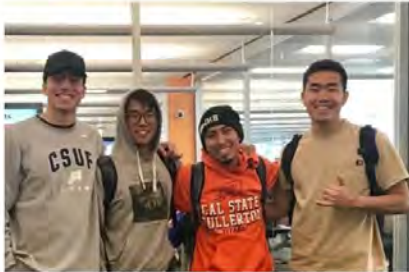
California California State University, Fullerton