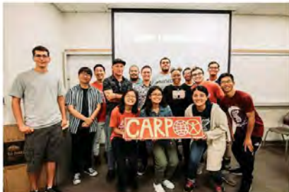
California El Camino College (ECC)