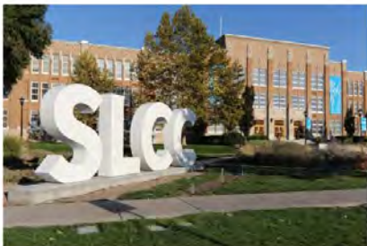
Utah Salt Lake Community College