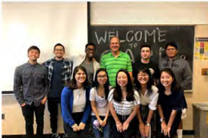
California California State University, Los Angeles