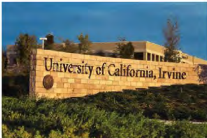
California University of California, Irvine