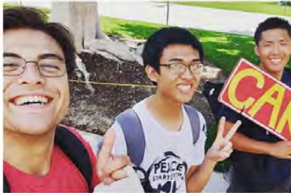
California California State University, Long Beach