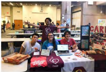
Texas Dallas College, North Lake Campus