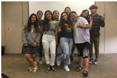
Hawaii University of Hawaii at Manoa