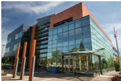
Oregon Portland Community College