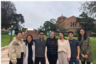
California University of California, Los Angeles