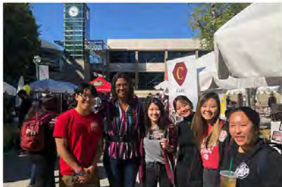
California Pasadena Community College (PCC)