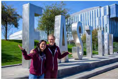
California California State East Bay