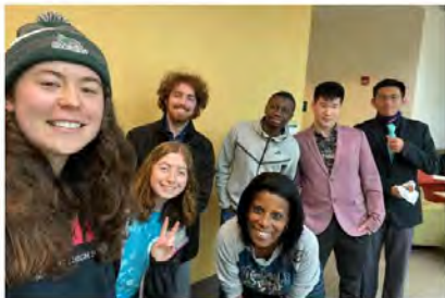
Washington Shoreline Community College