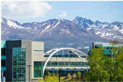
Alaska University of Alaska, Anchorage