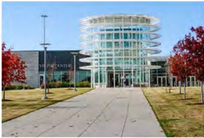
Texas University of Texas, Dallas