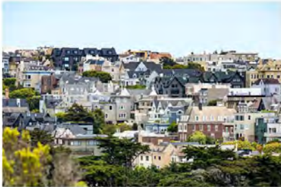
California California State Polytechnic University, Pomona