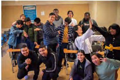
California Chabot College