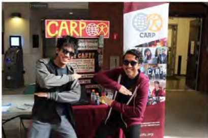
California East LA College (ELAC)