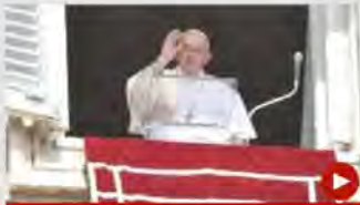
15/10/2023 Pope at Angelus: Say yes to God's invitation to joy and communion