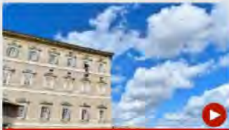
29/10/2023 Pope at Angelus: Let us learn from God's love for us