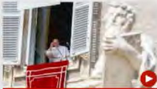
22/10/2023 Pope at Angelus: Faith and daily life are intimately connected