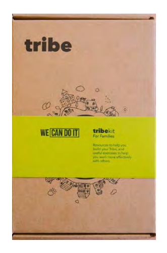
2) The Leaders Workshop