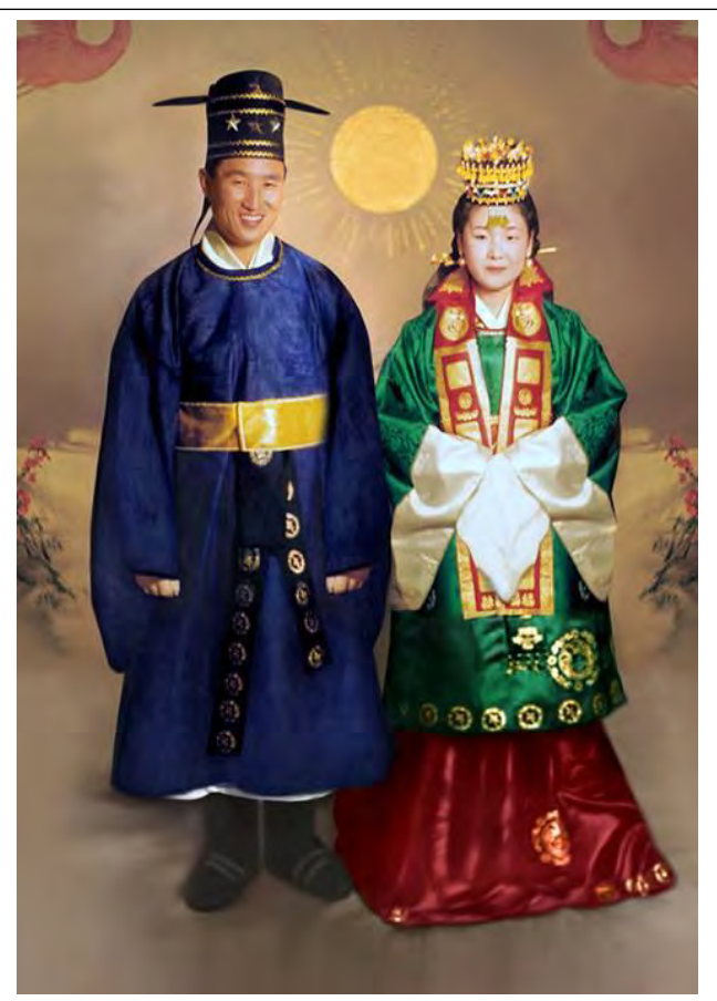
<u>Father</u> and <u>Mother Moon</u> at the second part of their <u>Holy Wedding</u> on 11th April 1960 in Cheongpa, Seoul

lunar calendar fell on in 2021. In 2024, it falls on 24th April.