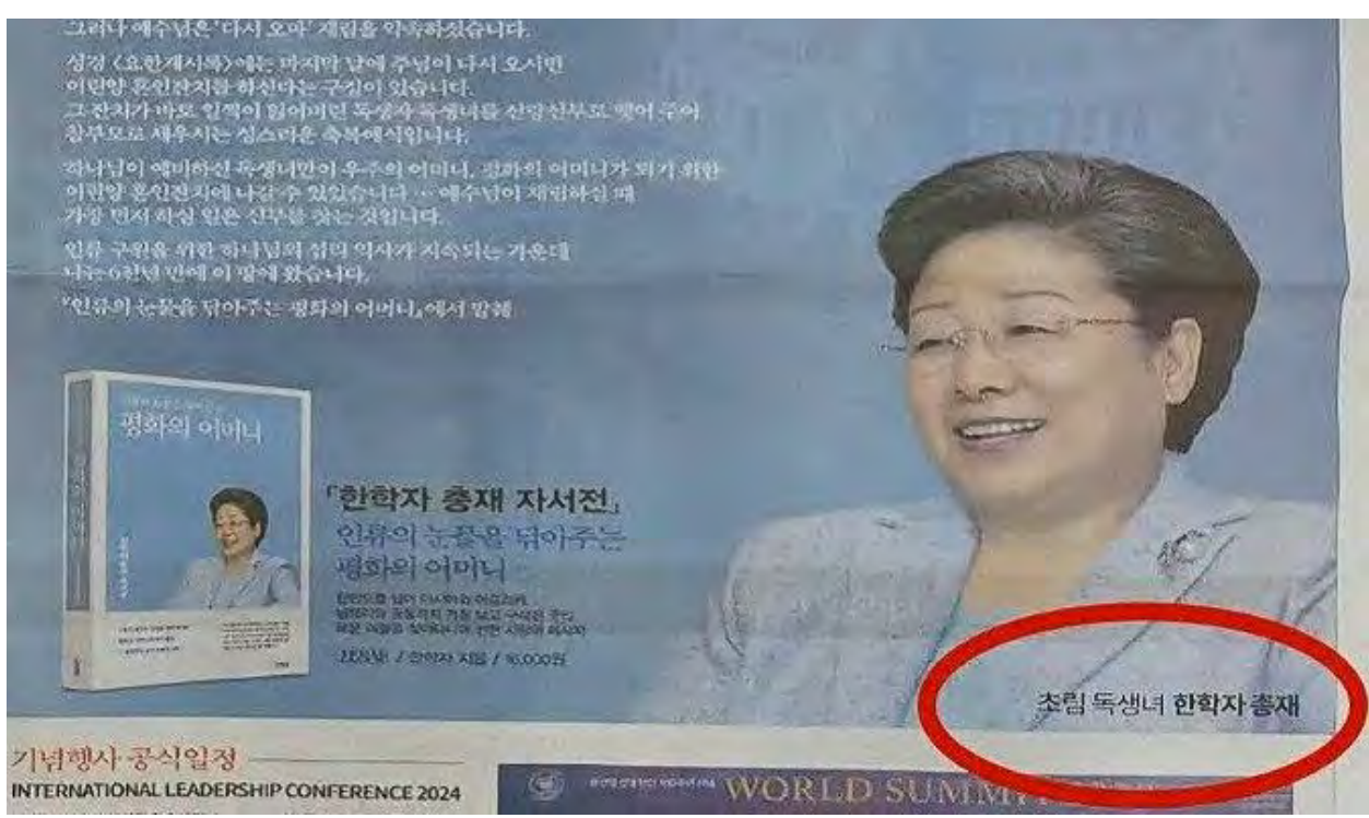
Facsimile from full page ad featuring Mother Moon in many South Korean newspapers during April 2024