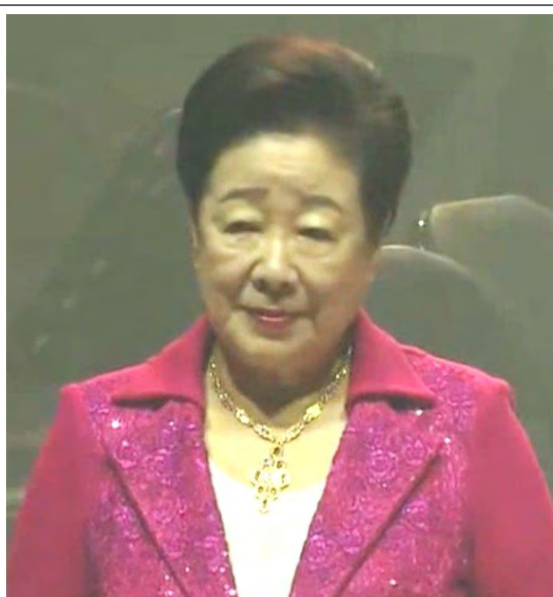
Mother Moon at the celebration 24th April 2024

A grand celebration of Father and Mother Moon 's Holy Wedding anniversary was held on 24th April 2024 at the Hyojeong Cultural Center, a large indoor stadium located in Gapyeong , northeast of the South Korean capital Seoul.