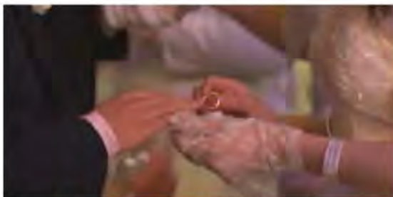
One of the couples 24th April 2024 exchanging rings.

"As a family with the responsibility to fulfill the perfected families envisioned by our Heavenly Parent in the beginning, do you promise to become couples for eternity, continue the traditions established by the True Parents and form ideal families that seek the realization of God's kingdom ."