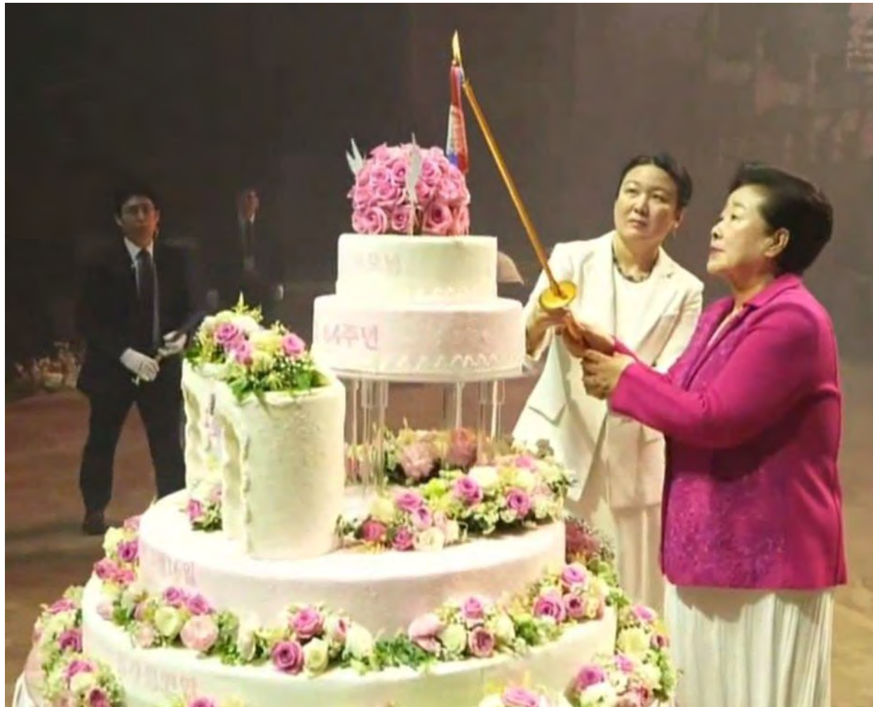
Mother Moon cutting the cake at the celebration of her Holy Wedding anniversary 24th April 2024