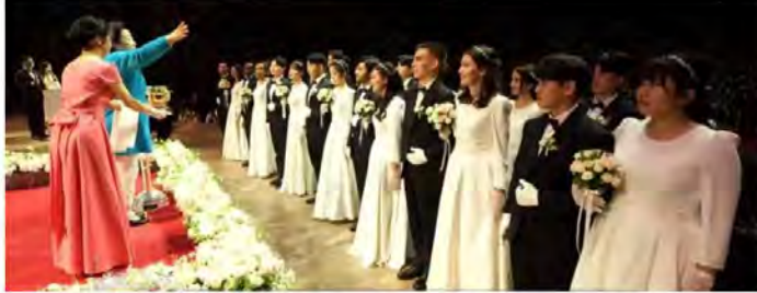
Mother Moon, Hak Ja Han, sprinkling holy water on couples 24th April 2024.

A large wedding for 2100 couples took place 24 th April 2024, with the main event in Hyojeong Cultural Center in Gapyeong , northeast of the South Korean capital Seoul. The large ceremony was officiated by Mother Moon on the same day as her and her late husband Father Moon's 64 th Holy Wedding anniversary was celebrated.