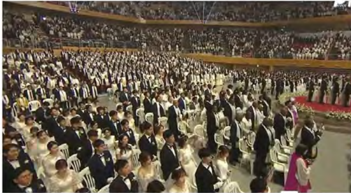
From the large Marriage Blessing in Hyojeong Cultural Center in Gapyeong, South Korea 24th April 2024.

Then followed the blessing prayer by Mother Moon .