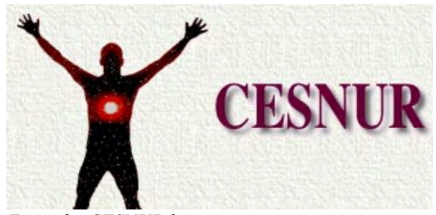
From the CESNUR logo