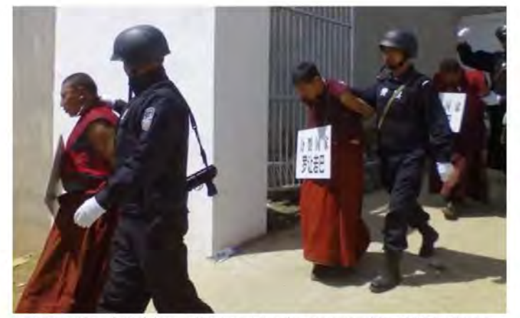
Persecution in China: Tibetan Monks arrested in 2008.

unusual in a democratic country that upholds freedom of religion. He points out that the current events in Japan are being highlighted in Chinese and Russian media as a form of propaganda, drawing parallels between Japan's actions and those of China in suppressing religious groups. Introvigne explains how the situation in Japan is being used for propaganda purposes by China and Russia ,