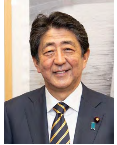
Assassinated on 8th July 2022. Here, former Japanese Prime Minister Shinzo Abe some months earlier, in March 2022