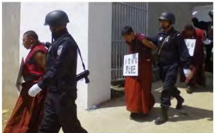
Persecution in China: Tibetan Monks arrested in 2008. Photo (5th April 2008): SFT HQ (Students for a Free Tibet) / Wikimedia Commons. License: CC Attr 2.0 Gen. Cropped

unusual in a democratic country that upholds freedom of religion. He points out that the current events in Japan are being highlighted in Chinese and Russian media as a form of propaganda, drawing parallels between Japan's actions and those of China in suppressing religious groups. Introvigne explains how the situation in Japan is being used for propaganda purposes by China and Russia,