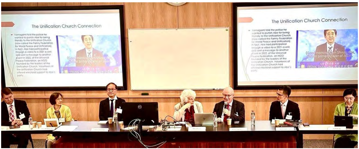
The panel during session 8 at the 2024 CESNUR conference in Bordeaux, France