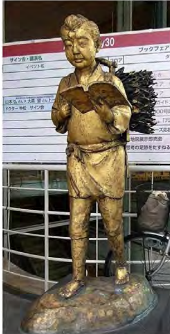
A statue of Kinjiro Ninomiya.

And still more, related to anti-religious bandwagon: 12 Religious Freedom NGOs Denouncing Japan