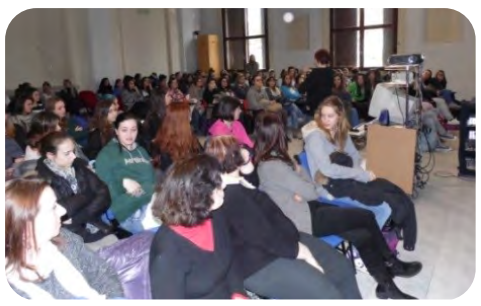
Education in schools