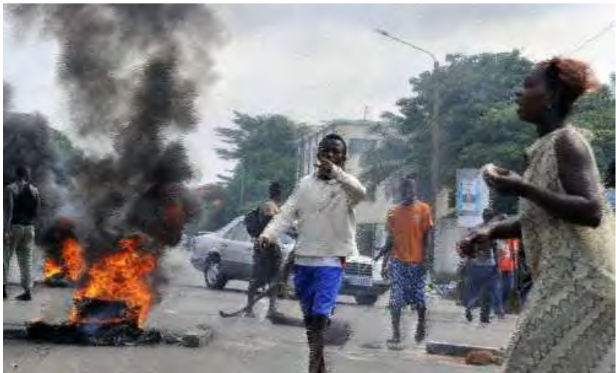
A 2010 scene from the Ivorian Civil War

Personal transformation is a journey and it can take a lifetime. Every day is a new discovery on our journey. The changes come slowly and sometimes with considerable difficulty, but nonetheless, they are worth achieving.