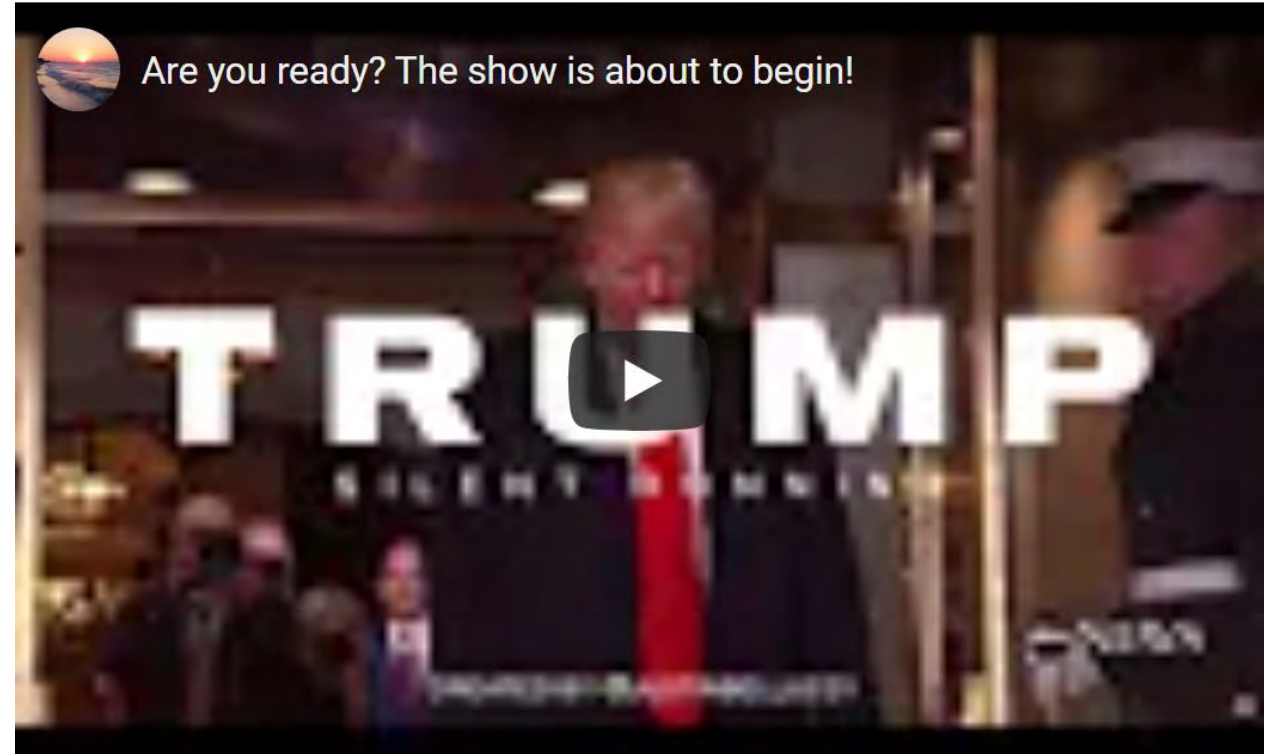
Former federal prosecutor Sidney Powell claims Donald Trump can "simply be reinstated" to fill out President Joe Biden's term. (1)

Wake up : Trump is still the president. Military is in control, not the fake Biden (just an actor). This is sting operation to catch all corruption in the political and legal system. Think Military Tribunals. No escape. The legal battle is simply to show and expose. Don't expect Cabal governed legal system to solve the problems. Trust God! All will be exposed, including the Cabal's depopulation scheme!