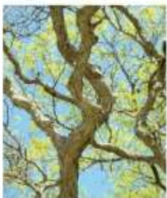
white shin oak