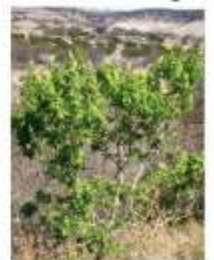
Texas white buckeye