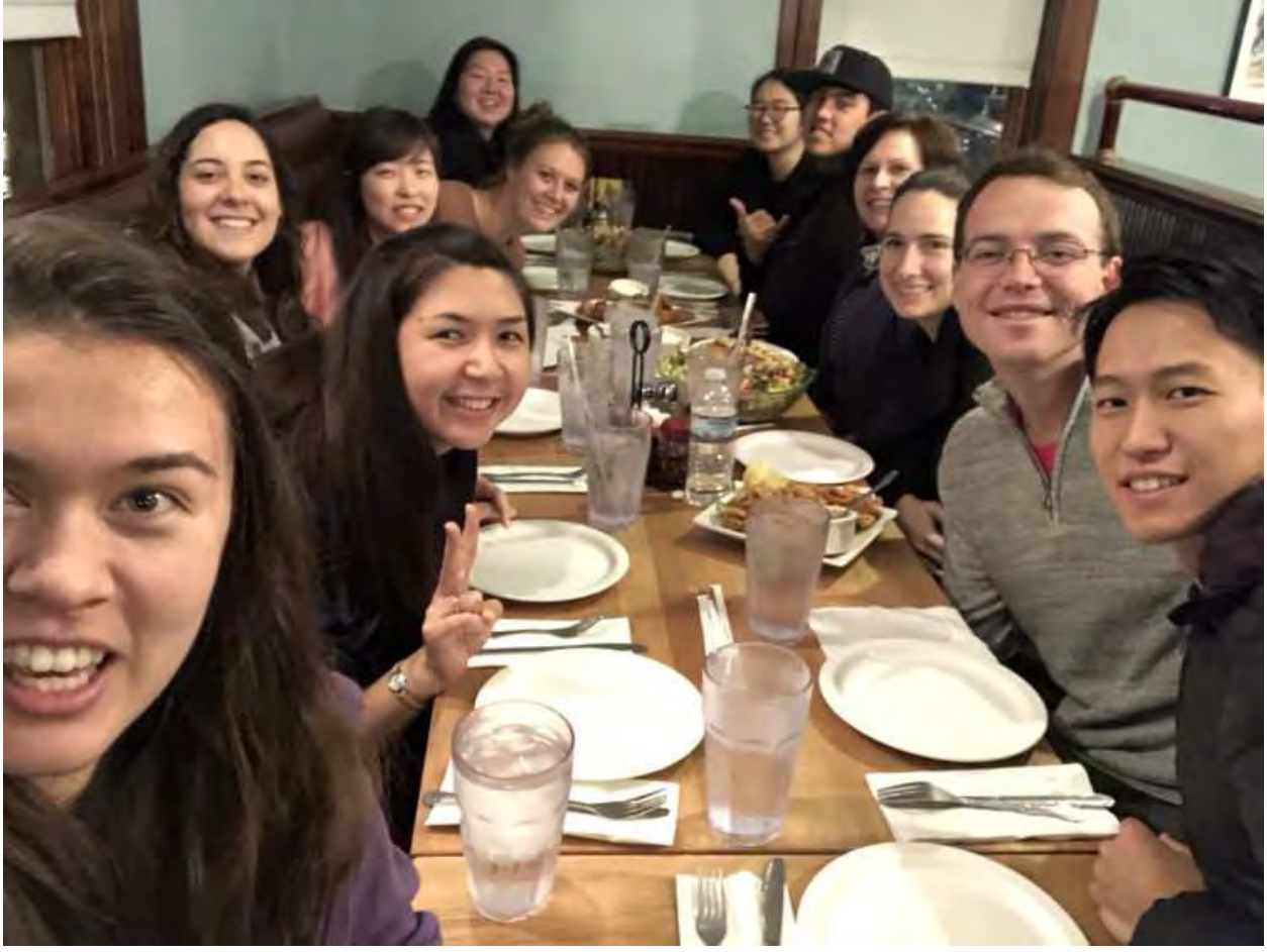
The CARP Chicago crew smiles before the pizza arrives.

Although our original plan was to meet with CARP Chicago on November 2nd, we ended up meeting them November 4th for dinner for classic Chicago deep dish pizza.