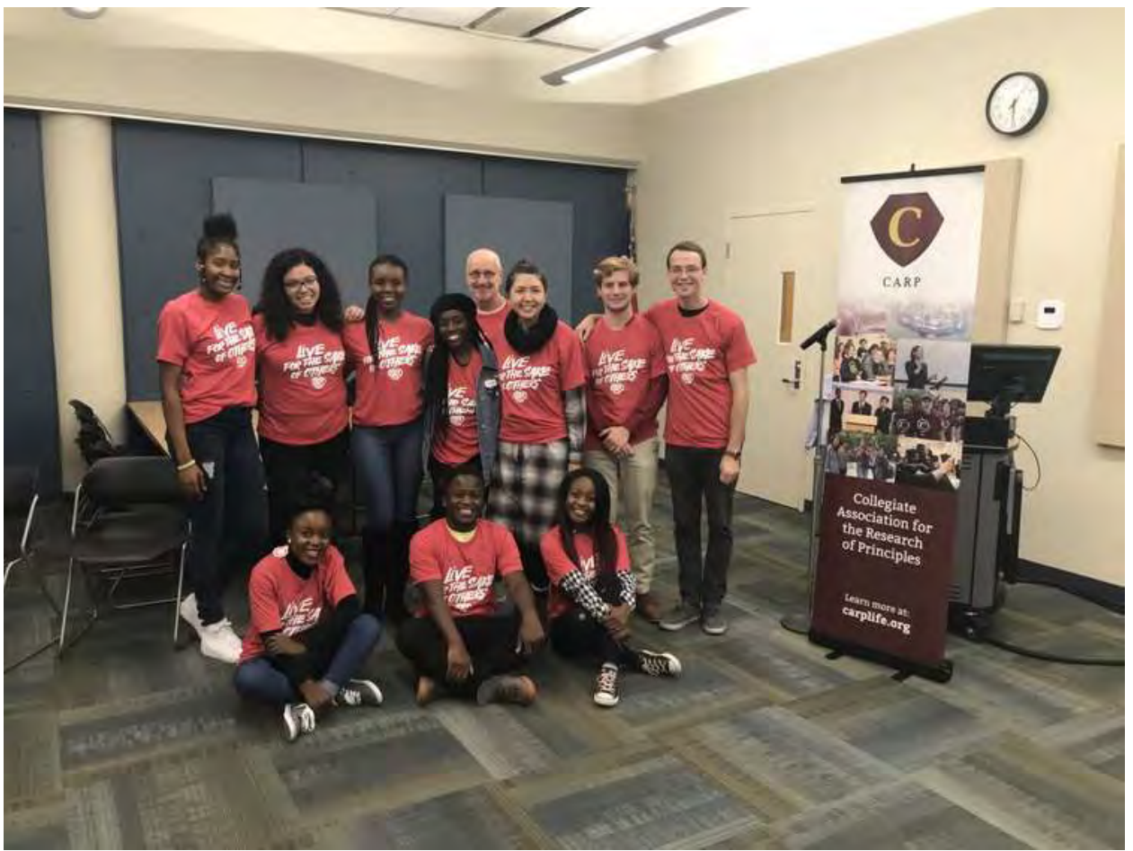
CARP Grand Rapids is fully decked out with the National CARP gear.

We arrived on Grand Rapids Community College (GRCC) campus on October 31st. On GRCC campus, they have screens advertising their upcoming events and club activities. The first thing we noticed was that CARP was on those screens!