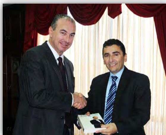
Mayor receives Father Moon Autobiography