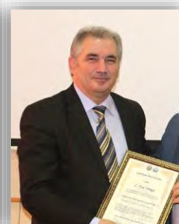
Newly appointed ambassadors for peace