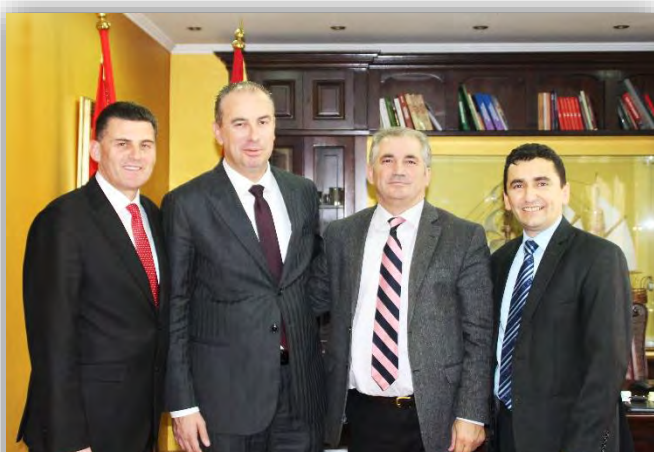
At the Mayor's Office