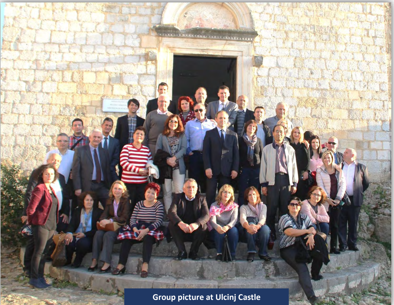
Group picture at Ulcinj Castle