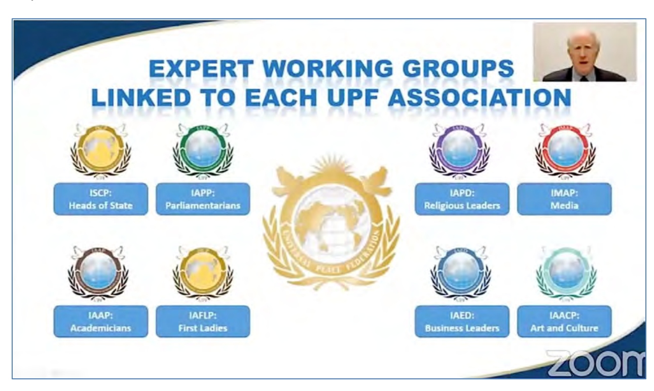
Africa -- UPF-Africa hosted ILC2021, webinar series 3, September 9-10, 2021 on the theme, "Toward Peaceful Reunification of the Korean Peninsula: Prospects for Economic Development and Peace; Ideologies, Worldviews and International Relations." Cohosts included: ISCP, IAPP, IAPD, IMAP, IAED, IAFLP, IAACP, and the Peace Road Foundation. There were 6 sessions featuring about 20 VIP speakers. The audience numbered many, many thousands throughout the continent participating via livestream, YouTube, Facebook and Telegram.