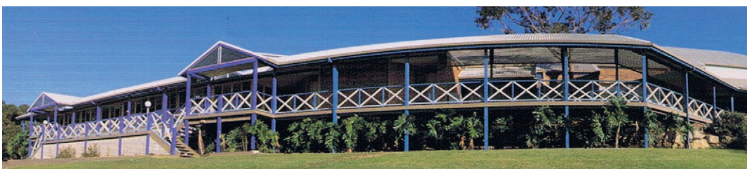
Collaroy Conference Centre