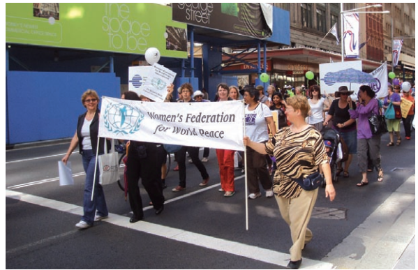
WFWP members of Sydney taking part in International Women's Day march on 8 March