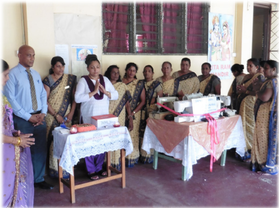
Opening Ceremony of Sewing machine Training centre by Nandani Mahila Mandal