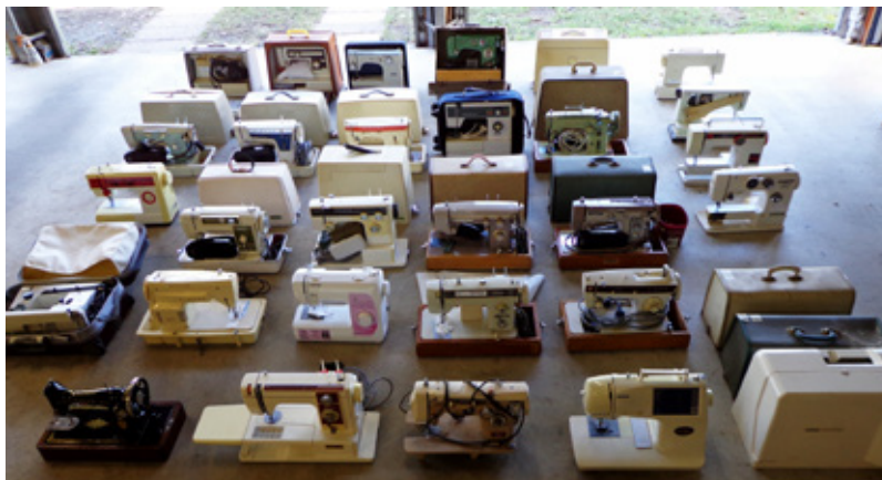
Collection of sewing machines sent to Fiji