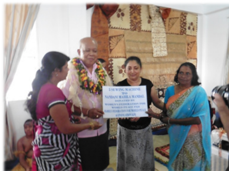
Left to right, Permanent Secretary to the Ministry of Women, WFWP Fiji

The women's groups pledged to establish a 'sewing training center' in their respective areas and train local women. WFWP Fiji aims to regularly visit and consult with the women's groups and buy products made through the sewing centre's, using this clothing to raise funds for the sake of needy people in society.