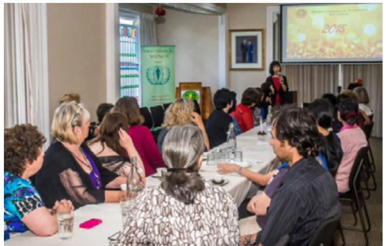
Guests at the event