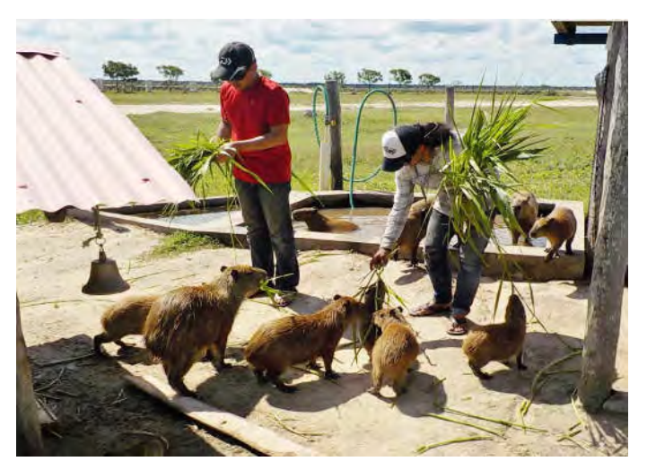
The friendly Capybaras