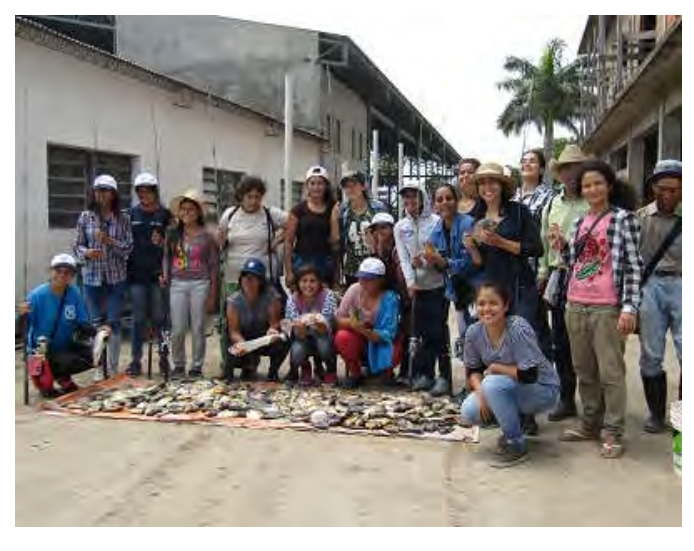
Big smiles with a big catch!