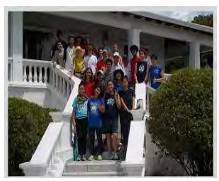
In front of the Official Residence