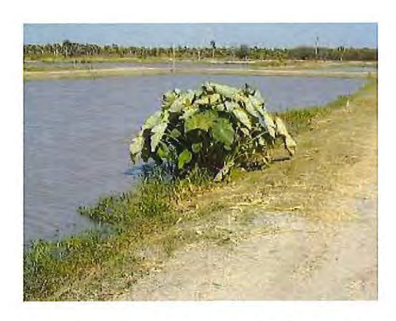
Taro is growing naturally by a fish pond.