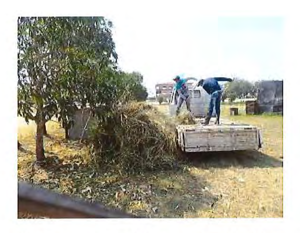
Piling grass fertilizer at the first farm.