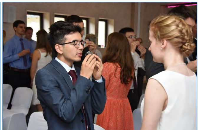
Greetings by the second generation MC - Holy Wine Ceremony