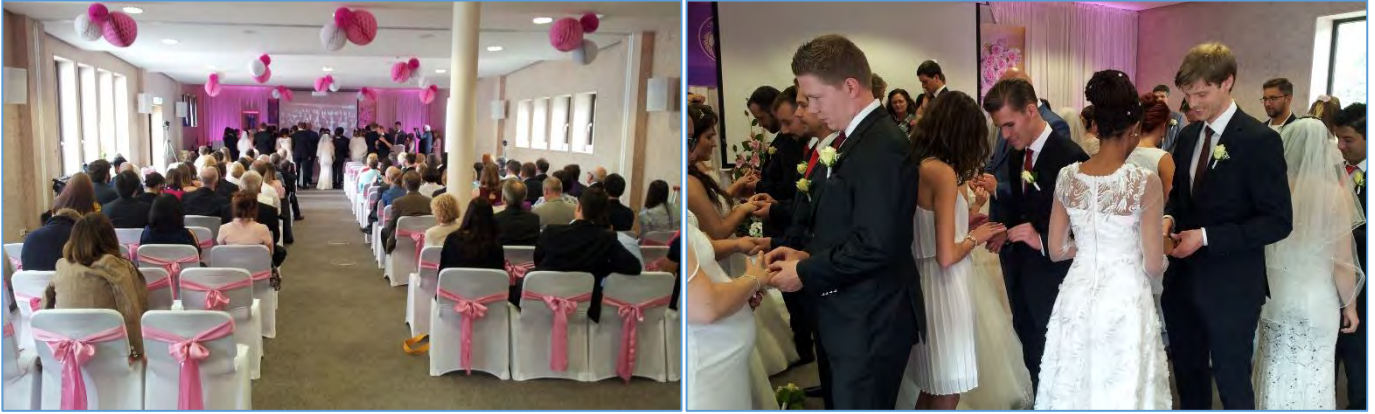
Benediction prayer by True Parents on video - exchange of rings