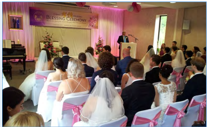
Couples waiting for entrance - welcoming remarks from the officiator