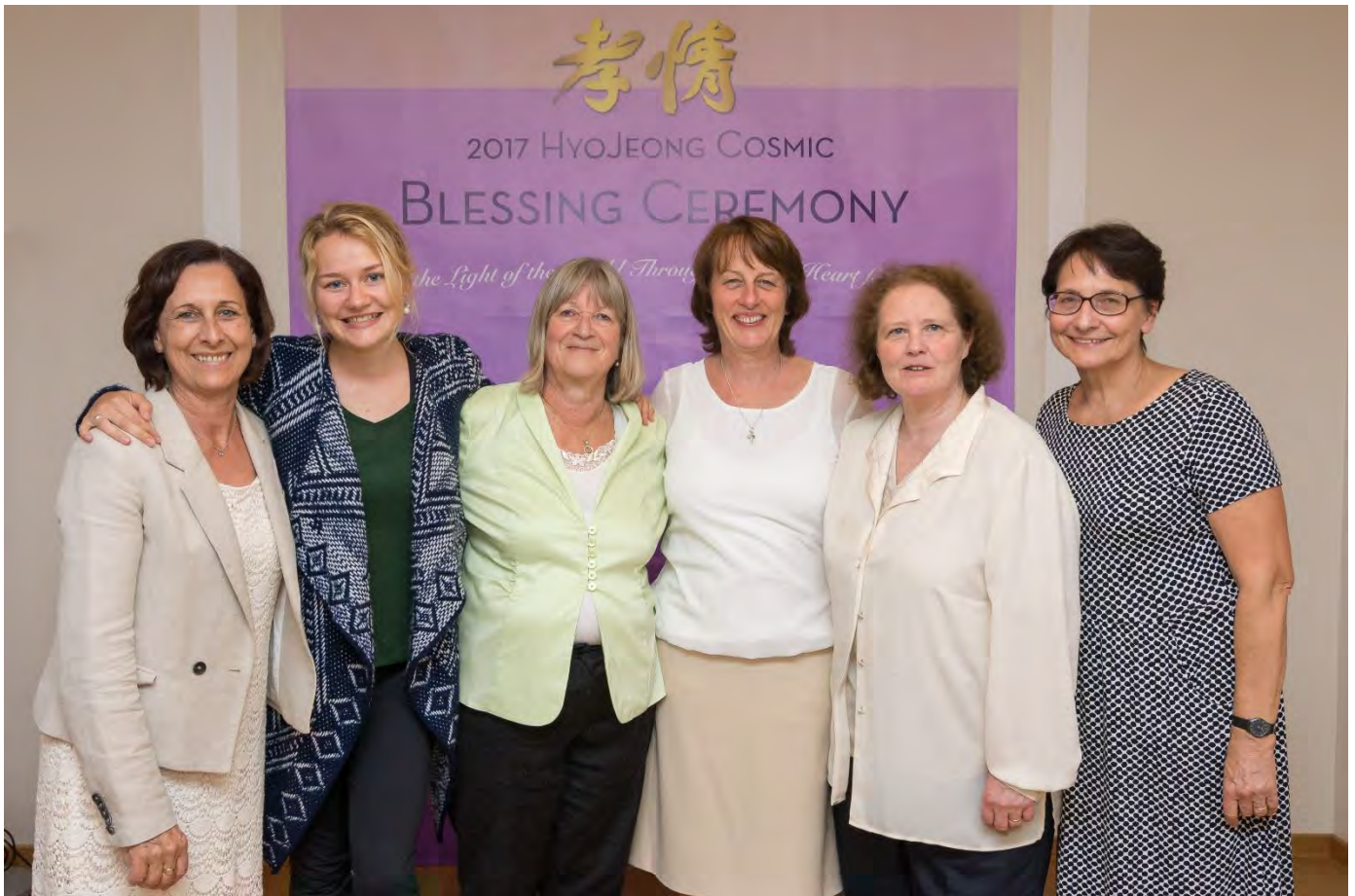
The preparation team