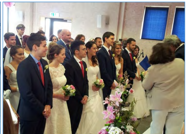
Holy Water Ceremony - Blessing Vows