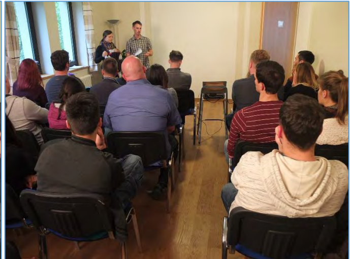
Guidance for family life - testimony by a second generation family