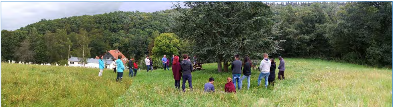
Prayer at the Holy Ground