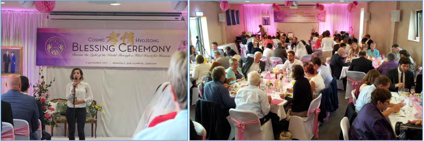
Congratulatory song - banquet