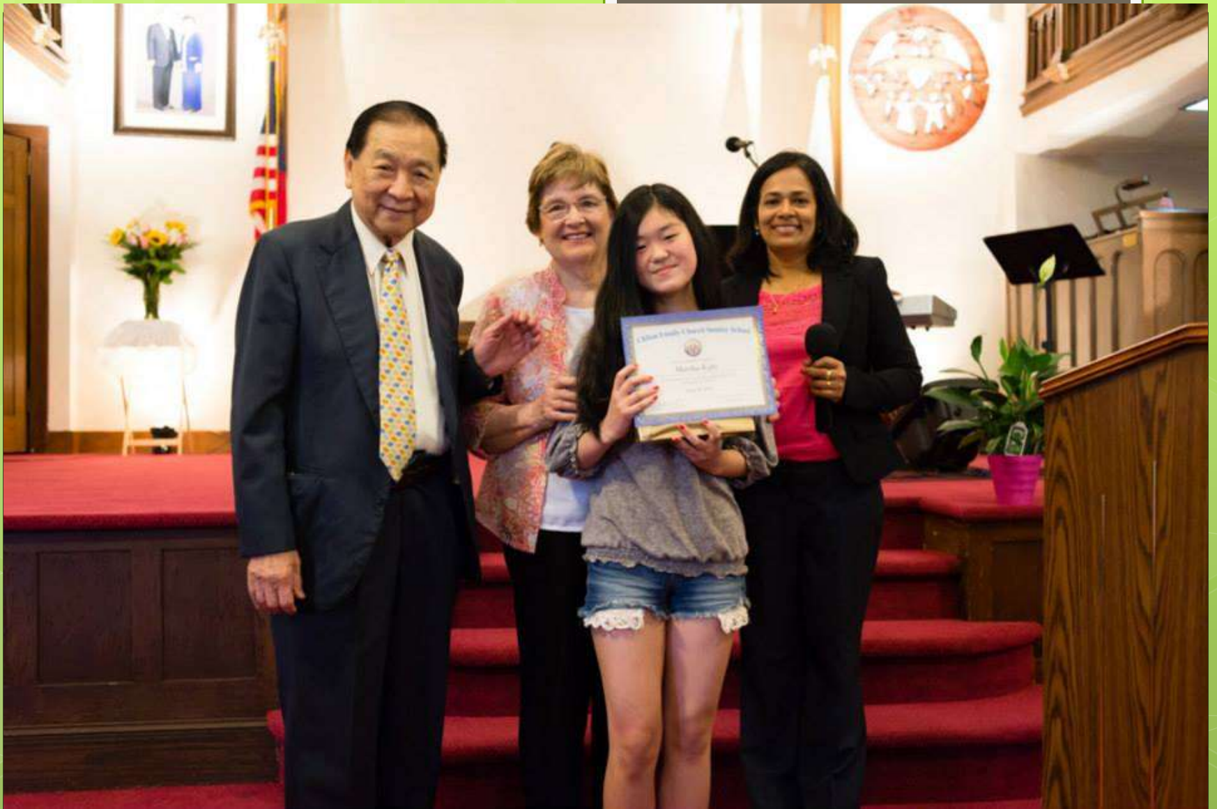
Sunday School Graduation