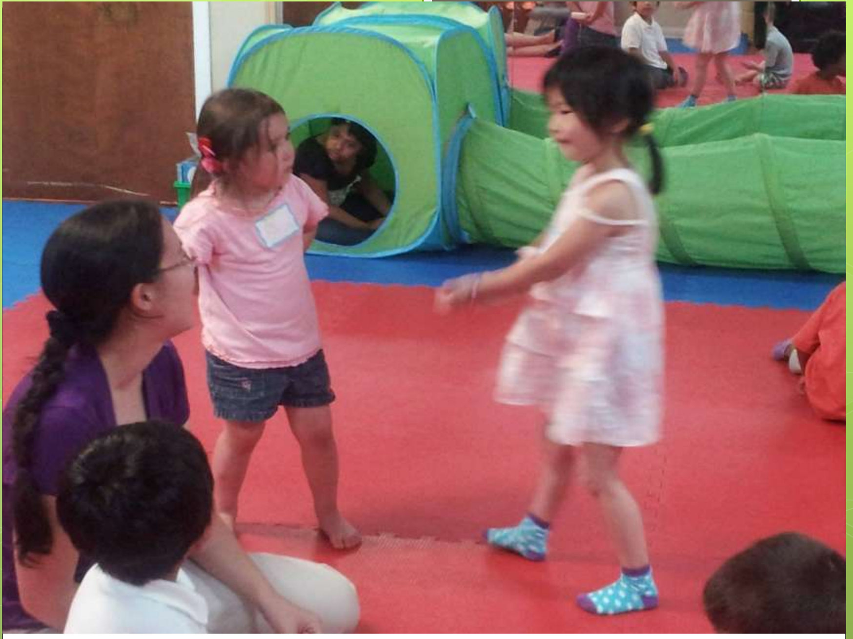
Summer Time Kids Care