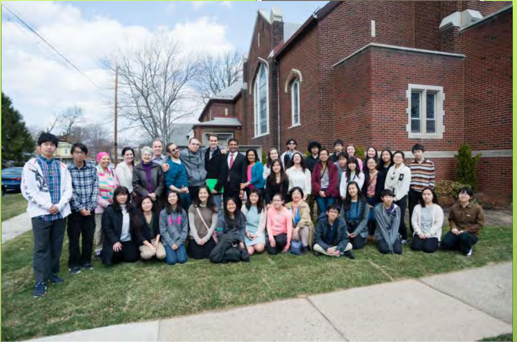
Sunday School Team (Staff and Volunteers)