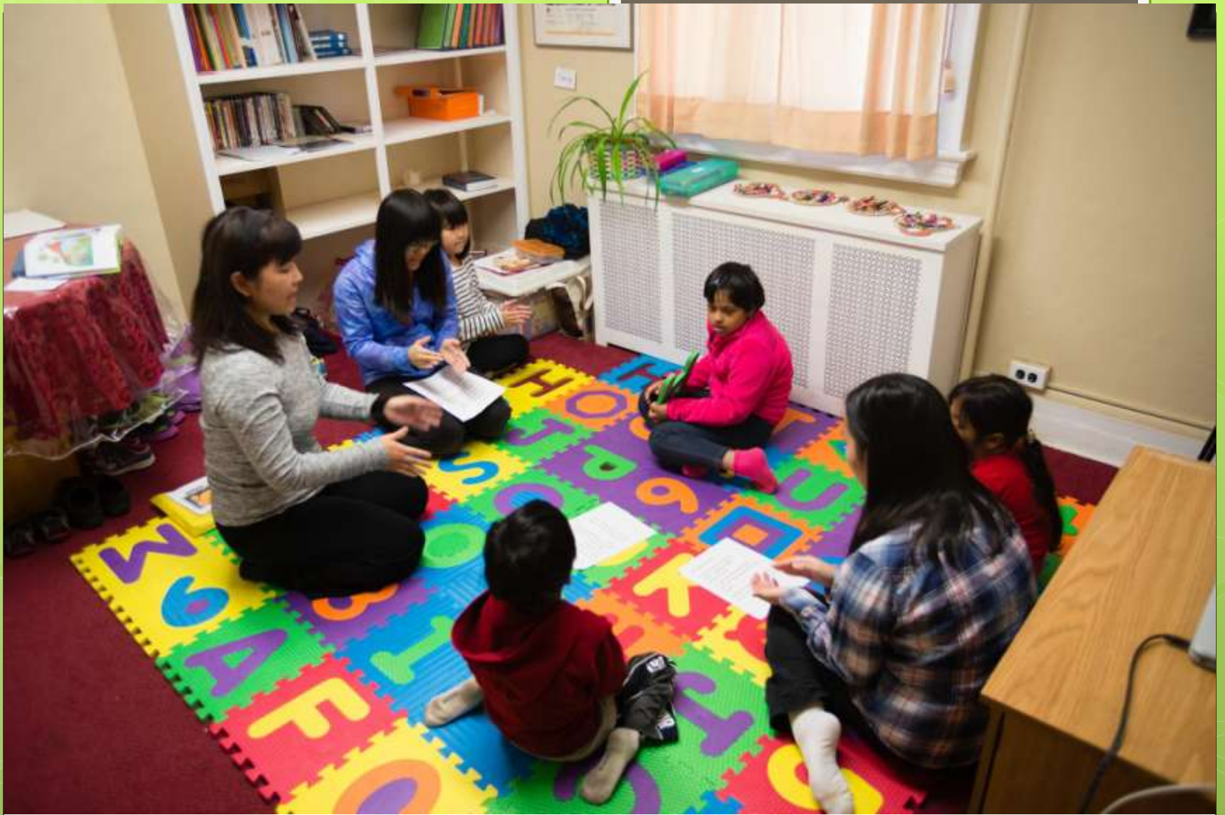
Seven Grades form pre-K to 7 th grade.