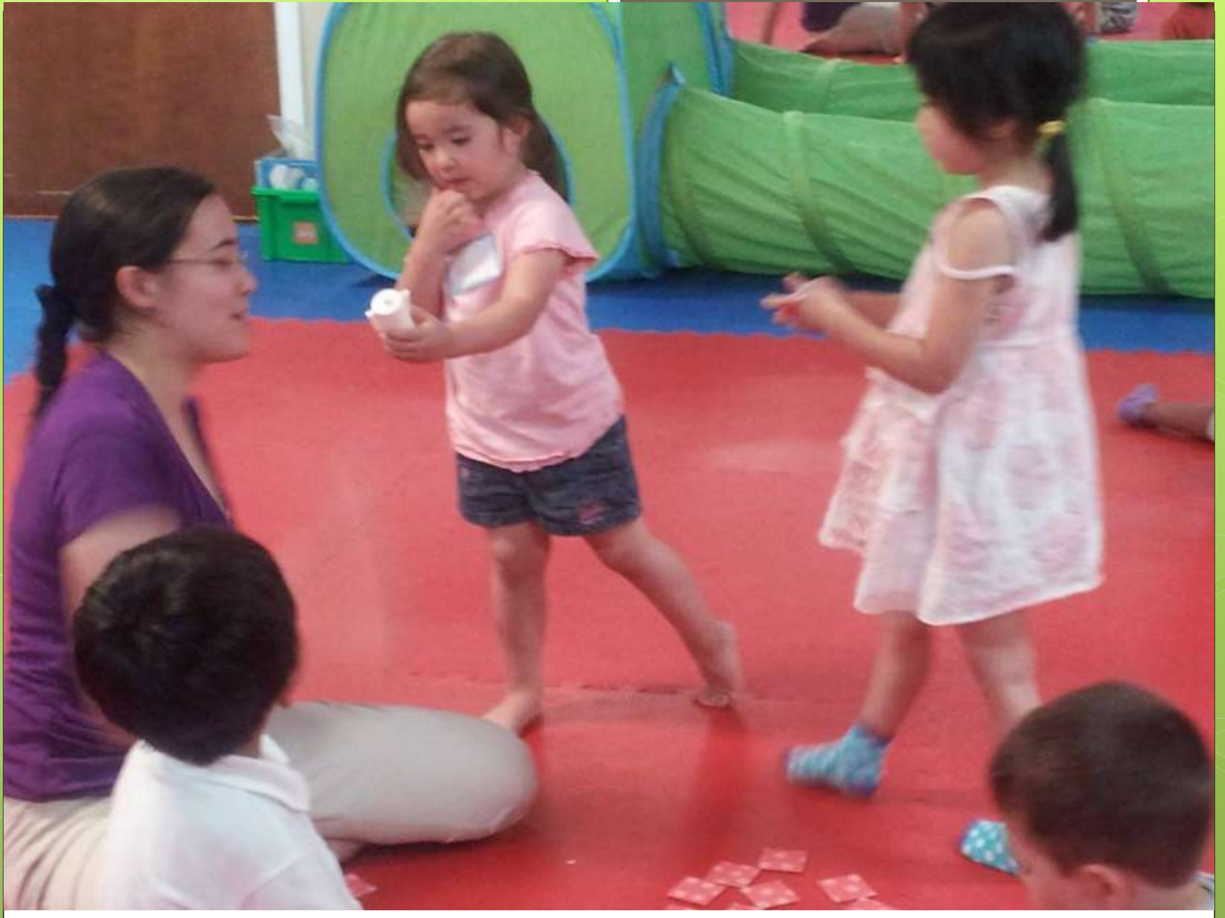
Summer Time Kids Care